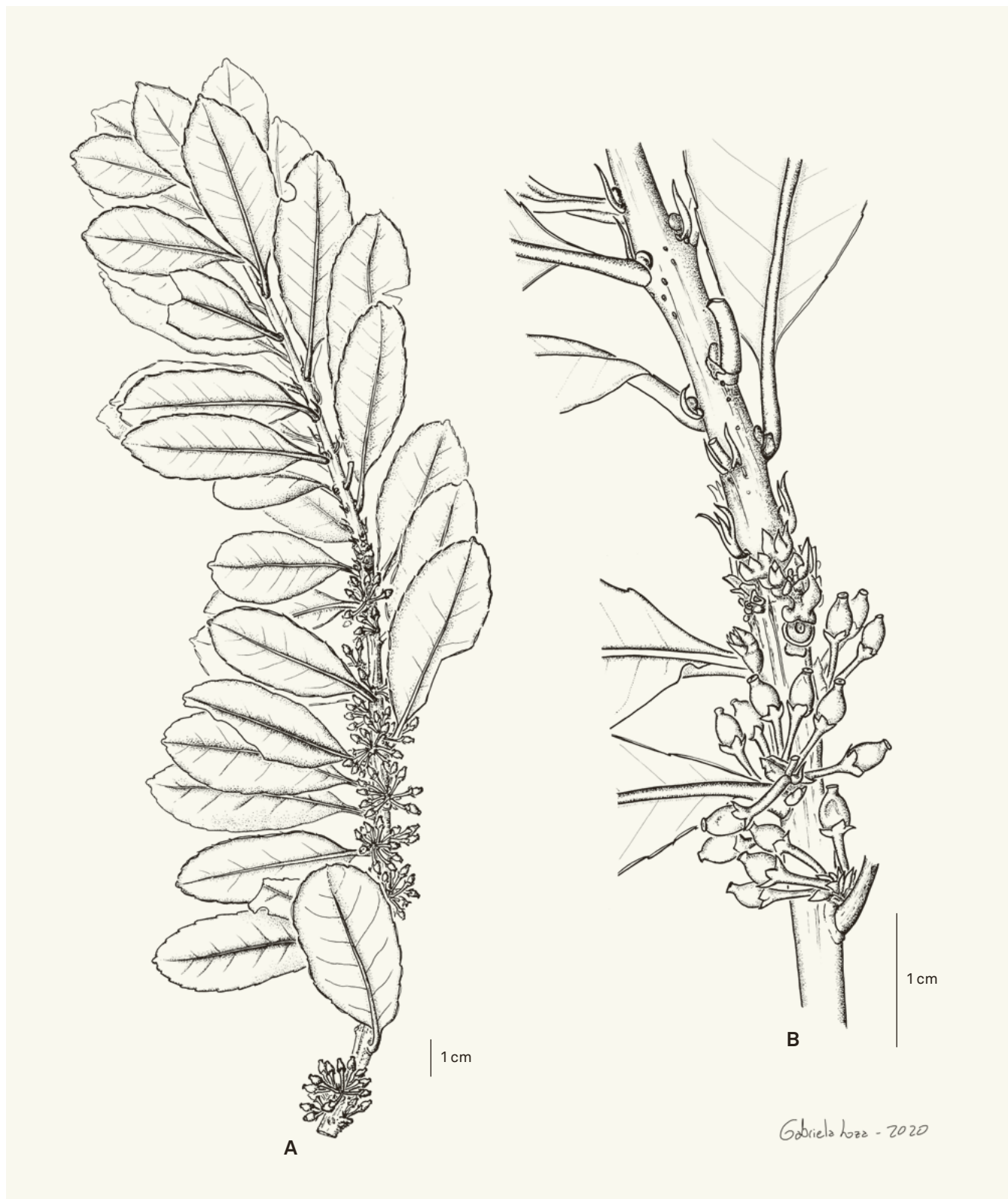
Fig. 9. – Ilex laurina var. tenuifolia Barriera. A. Female branchlet; B. Details of the inflorescences (corollas dropped). [Neill et al. 13710, G] [Drawings: Gabriela Loza]