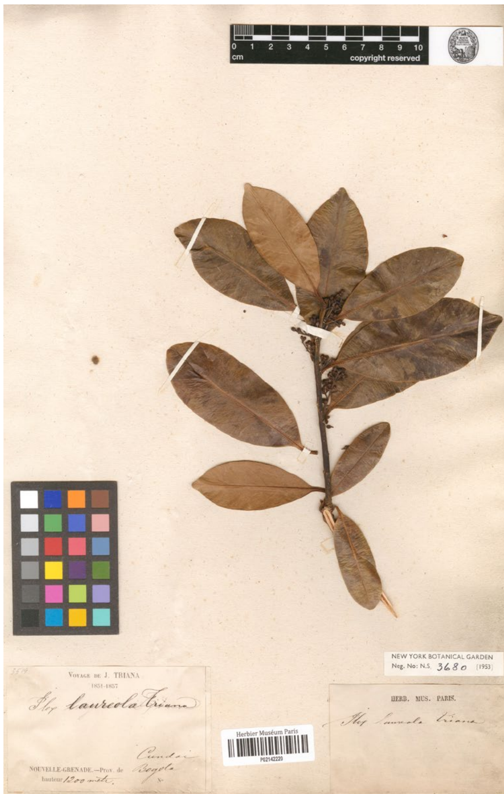
Fig. 2. – Holotype of Ilex laureola Triana. [Triana 3519] [P02142220]