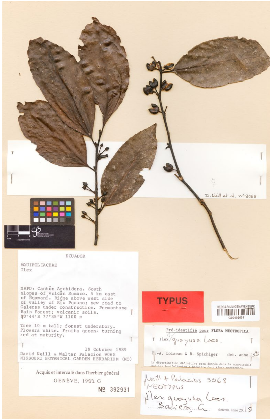
Fig. 8. – Neotype of Ilex guayusa Loes.

[Neill & Palacios 9068] [G00402601 part 1 of 2; Conservatoire et Jardin botaniques de Genève]