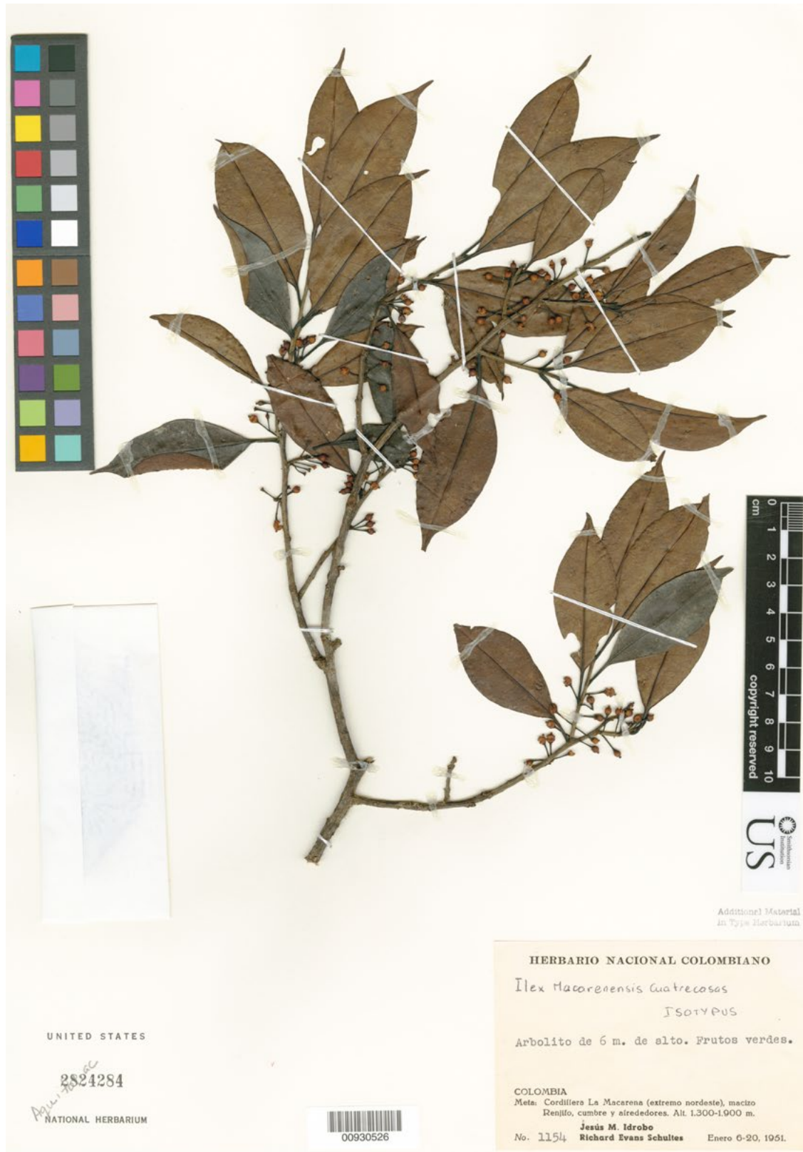
Fig. 10 – Isotype of Ilex macarenensis Cuatrec. [Idrobo & Schultes 1154] [US00930526]