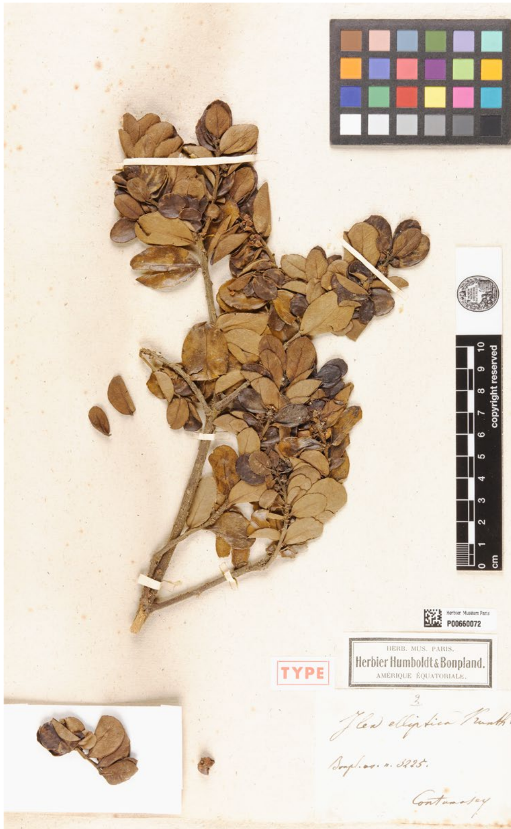
Fig. 6. – Holotype of Ilex elliptica Kunth. [Humboldt & Bonpland 3225] [P00660072]