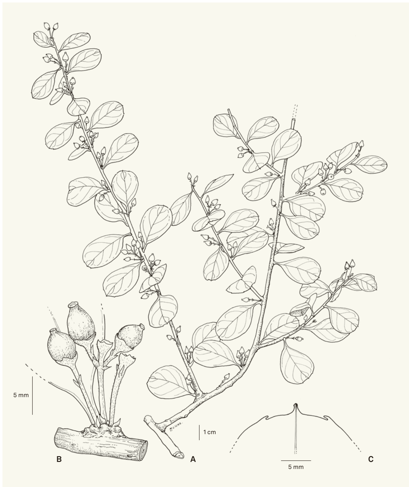
Fig. 4. – Ilex cochlearifolia Schlüssell & Barriera. A. Female branchlet; B. Detail of a thyrse (corollas dropped); C. Leaf apex. [Tipaz et al. 1823, G] [Drawings: Maya Mossaz]