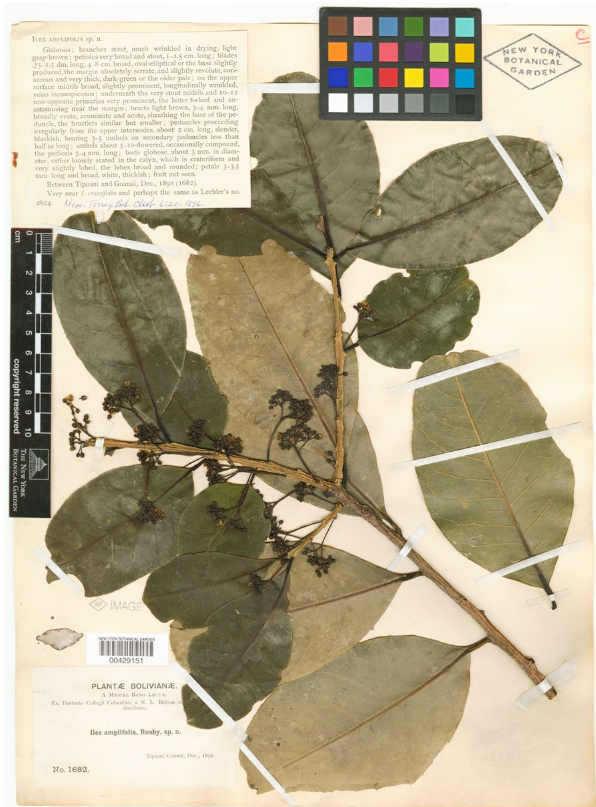
Fig. 3. – Lectotype of Ilex amplifolia Rusby. [Bang 1682] [NY00429151]