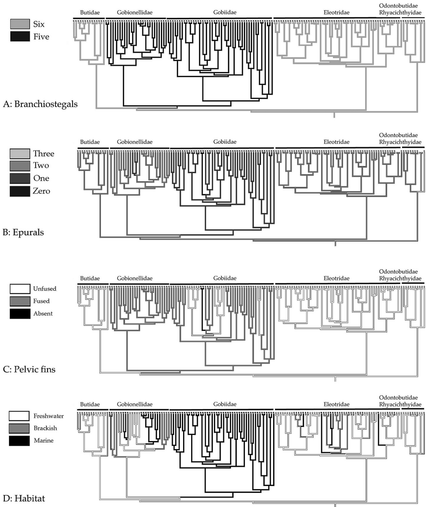
Fig. 2. Characters optimized on the phylogenetic hypothesis. (A) Number of branchiostegals; (B) number of epurals; (C) presence or absence of fused pelvic fins; (D) habitat. Outgroups are not shown, but were included in the character optimization; the state shown at the root of each phylogeny is that optimized for Gobioidae in comparison to outgroups.