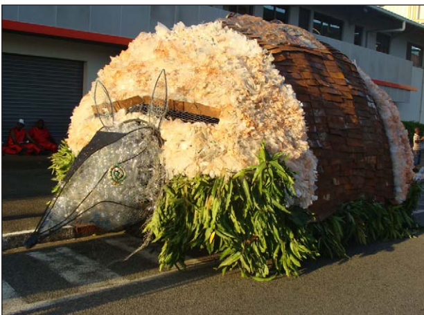
FIGURE 5. A representation of an armadillo at the main Carnival parade in Cayenne, February 2010.

were caught alone with no other conspecific in the immediate vicinity;