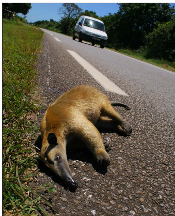
FIGURE 2. Roadkills are rather common along the paved roads in the northern part of French Guiana. Photograph by Sebastien Barrioz of a Tamandua tetradactyla along national road RN1 between Cayenne and Kourou.

According to reported observations in our database, all nine species of xenarthrans have been found as roadkills in French Guiana, but there has been no regular survey for quantifying road mortality. Certainly the most commonly found is Tamandua tetradactyla , which accounts for 14 out of