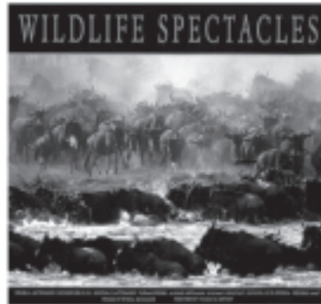
Available in English and Spanish