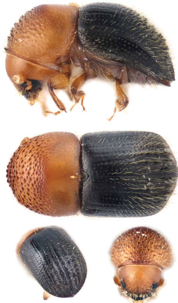
Fig. 2. Holotype of Xylosandrus aurinegro sp. nov. , female, from left to right: lateral view, dorsal view, posterior oblique view of declivity, anterior view of head. Specimen: 2.15 mm.

Head. Frons convex with surface reticulate, sparsely punctured; punctures between eyes with erect setae. Epistoma with dense row of short setae along lower margin. Eyes deeply emarginate, upper portion smaller. Antennal funicle 5-segmented (including pedicel), scape (short and stout) and funicle with scattered hair-like setae of variable size; club obliquely truncate, first segment sclerotized, forming a circular