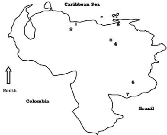
Fig. 1. Distribution of Heterotermes tenuis in Venezuela.

We found that H. tenuis is distributed around the northeastern and southern Venezuela in several habitats (Fig. 1), and is present at different altitudes from 10 to 1100 m (Table 1). The specimens found were soldiers and workers. We found minor soldiers only in the sample from Los Cerritos (Fig. 2, Constantino 2000). The measurements for H. tenuis ( n = 14 major soldiers) were 3.0 \pm