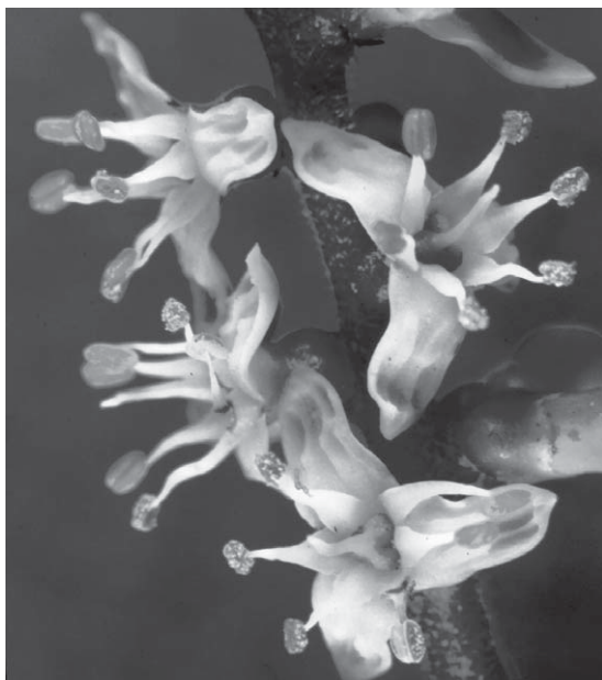
Fig. 1. Flowers of Serenoa repens .

Insect flower visitors were collected from saw palmetto as part of a long-term survey of all flower visitors on flowers of all species in all habitats at the ABS. This project was begun in 1984 and has continued, sometimes at a low level, up to the present. This has been a simple diversity survey; no attempt was made to assess the abundance of