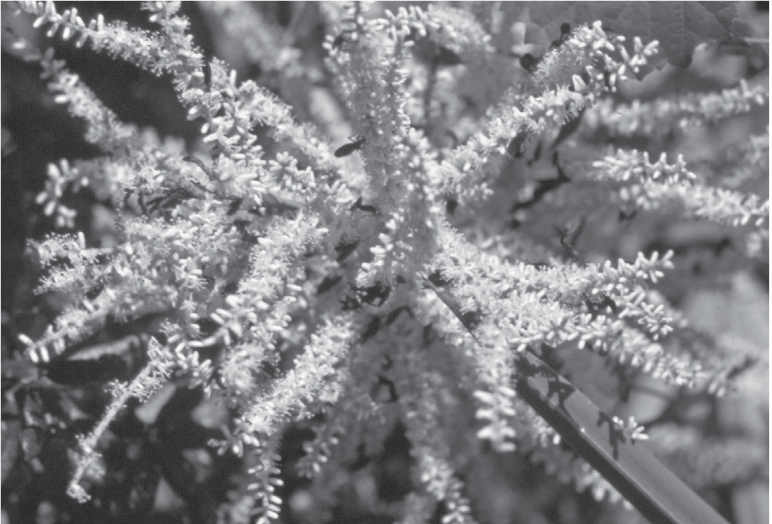
Fig. 2. Inflorescence of Serenoa repens .

insect species or pollination effectiveness on species of floral hosts, nor was there any attempt to devote equal effort to each plant species.