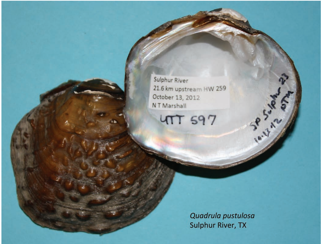
FIGURE 4 Pimpleback ( Quadrula pustulosa ) from the Sulphur River.

lienosa were found in several sites in the Neches River, one site on the Angelina River, often with two or three at a site although only 10 total live individuals were collected.