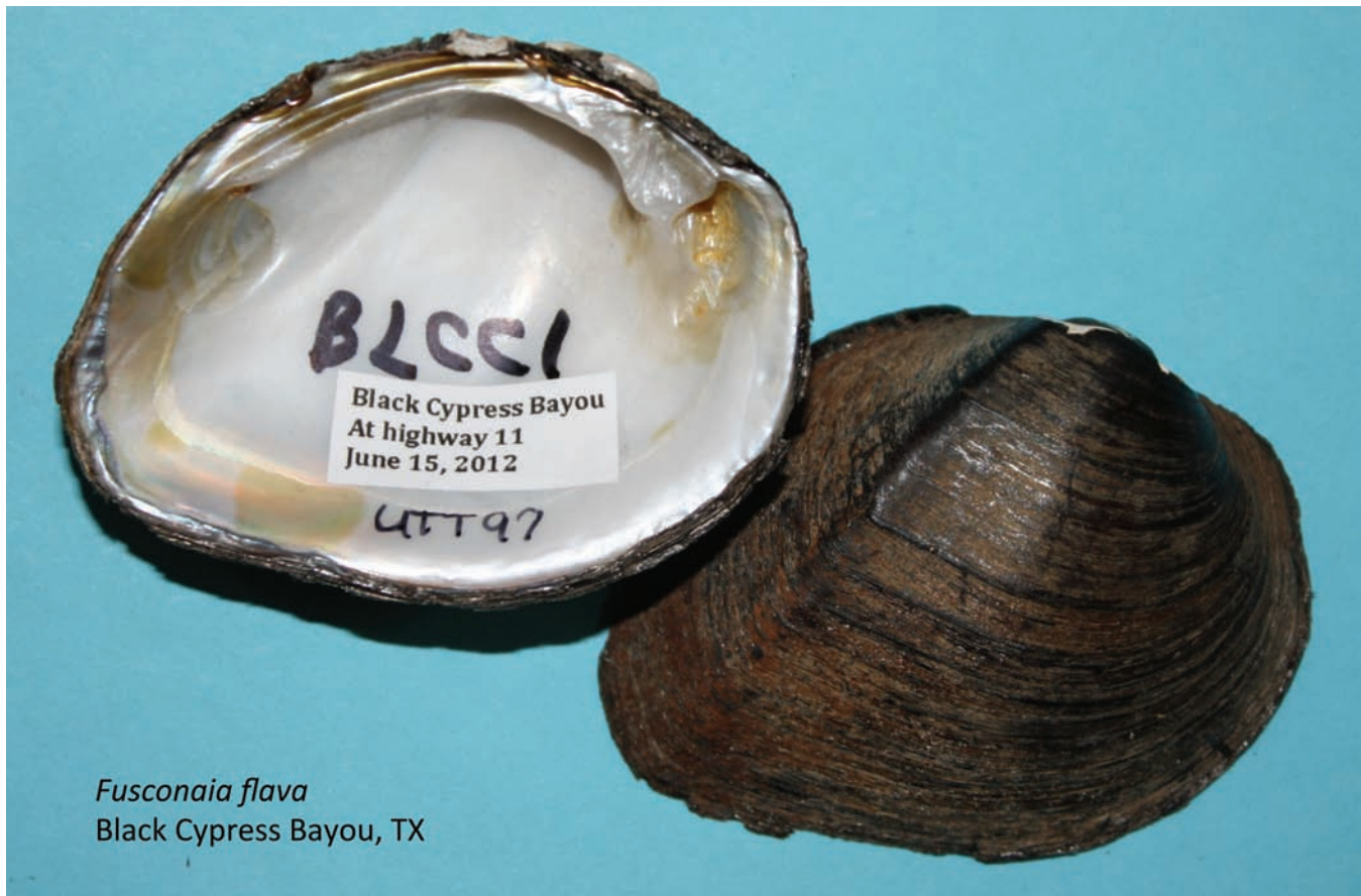
Fusconaia flava Black Cypress Bayou, TX