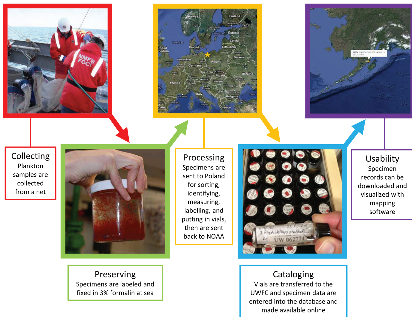
Fig. 2. Pathway of Early Life History collection specimens. First, plankton samples are collected by NOAA Fisheries AFSC FOCI (now the Recruitment Processes Program) scientists during annual surveys. Samples are then labeled and fixed in 3% formalin at sea. Next, samples are shipped to the Plankton Sorting and Identification Laboratory, Szczecin, Poland (ZSIOP), where they are sorted, identified, measured, and labeled. Larvae are placed in vials of 70% ethanol and eggs are placed in vials of 3% formalin. Labeled samples are then sent back to the AFSC for analysis. Quality control measures are in place to verify data and identifications. Samples are then transferred to the UW Fish Collection where they are cataloged and placed in cabinets. Specimen and locality data are entered in the collection database and uploaded to the online search engine at https://www.burkemuseum.org/collections-and-research/biology/ichthyology/collections-database/search.php . Specimen records can be downloaded and visualized with publicly available mapping software. Record shown is for Platichthys stellatus , UW 062774.

send it across the country. Knowing that contracts already existed between the AFSC RACE division and the UW Fish Collection to identify and archive adult specimens, FOCI scientists worked with Ted Pietsch to write an NSF grant proposal to create an archival center for early life history stages at the UW. This grant was awarded in 1991 allowing for the transfer of 48,000 lots collected between the late 1960s and mid-1980s. A reference collection of redundant material was sent to the USNM to fulfill the obligation of NOAA Fisheries collections being made available to the USNM.