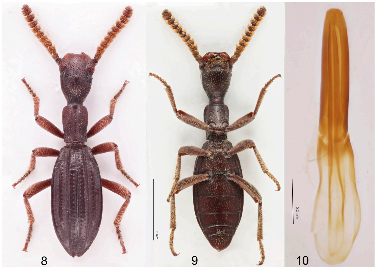
Figs. 8–10. Gebieniella stenosides . 8. Dorsal view, non-type. 9. Ventral view, non-type. 10. Aedeagus, non-type.

Cambodia, Battambang Prov., Sampov Lun, cave Rong Nou 2, N13°20'55.8" E102°30'13.5", 3.II.2018, leg. H. STEINER (039/18), 1 ex., SMNS. – Cambodia, Battambang Prov., Sampov Lun, cave La Ang Touch, N13°22'09.9" E102°22'18.4", 27.I.2018, leg. H. STEINER (090/18), 7 exx., SMNS (1 ex. with DNA extraction code SMNS-M374). – Cambodia, Battambang Prov., Sampov Lun, cave Rong Nou 1, N13°20'57.6" E102°30'15.7", 3.II.2018, leg. H. STEINER (101/18), 1 ex. dry mounted, SMNS, 1 ex. stored in ethanol, SMNS-M380. – Cambodia, Battambang Prov., Sampov Lun, cave Rong Barang Kleah 1, N13°21'42.6" E102°21'40.1", 25.I.2018, leg. H. STEINER (149/18), 2 exx. dry mounted, SMNS, 1 ex. stored in ethanol, SMNS-M382. – Cambodia, Battambang Prov., Sampov Lun, cave La Ang Barang Kleah 2, N13°20'41.1" E102°21'36.4", 8.II.2018, leg. H. STEINER (164/18), 4 exx., SMNS, 1 ex. with DNA extraction code SMNS-M375. – Cambodia, Battambang Prov., Sampov Lun, cave La Ang Som Nak Poa, N13°21'43.0" E102°21'56.1", 24.I.2018, leg.