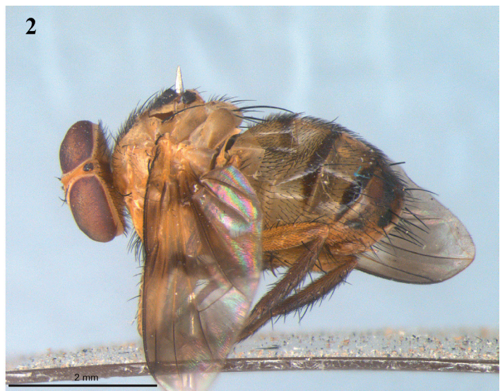
Figs. 1–2. Cenosoma catiae sp. n., lateral habitus. 1. Holotype female. 2. Male paratype.