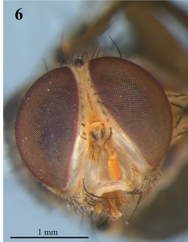
Figs. 3–6. Cenosoma catiae sp. n., dorsal habitus and head in frontal view. 3, 4. Holotype female. 5, 6. Male paratype.