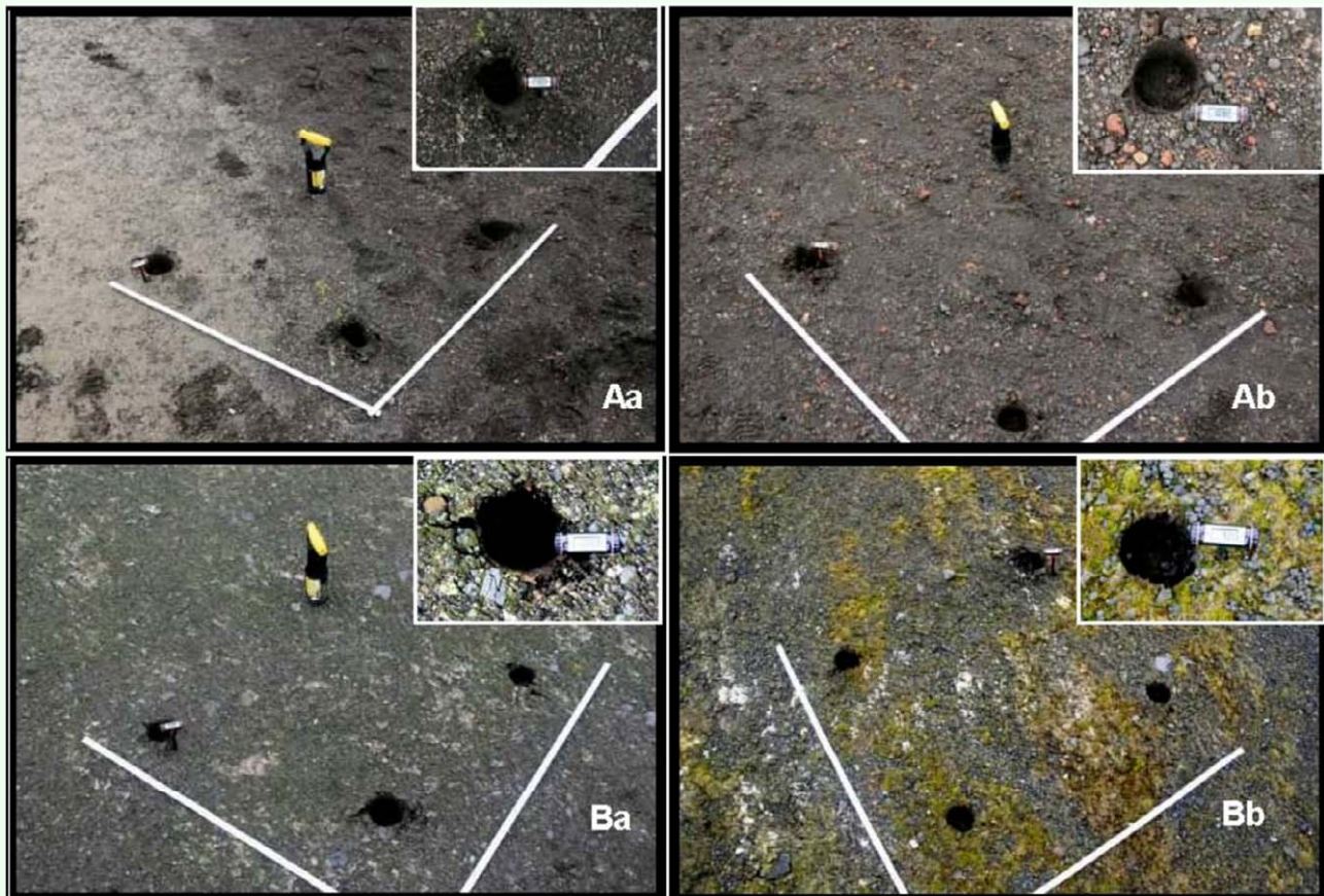
Figure 3. Photographs of soil core sampling sites at Whalers Bay. (a,b) impacted sites; (c,d) non-impacted sites. High quality figures are available online.