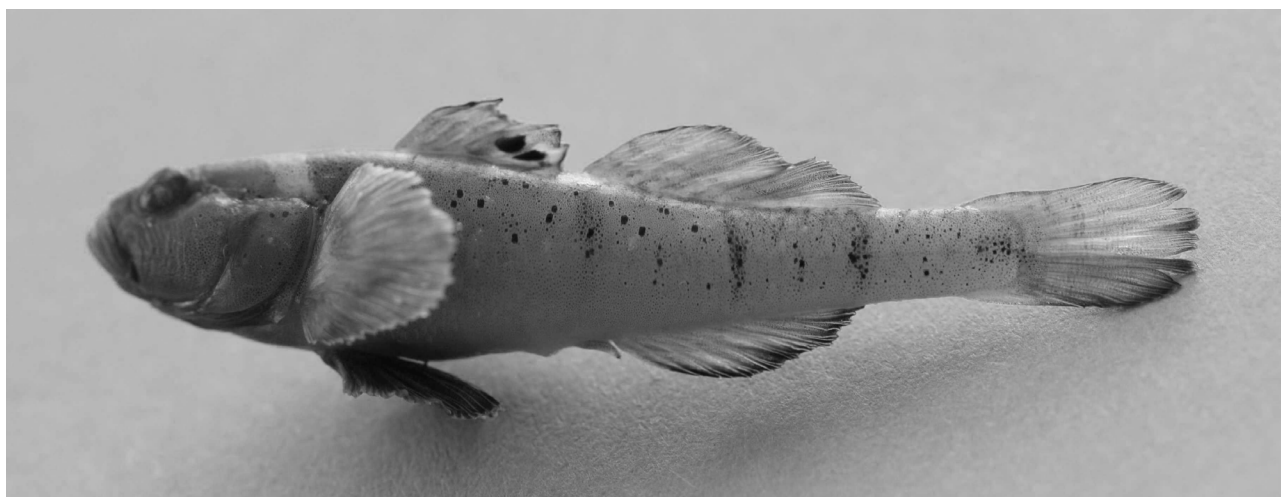
Fig. 5. Canestrini's goby Ninnigobius canestrinii (TL = 45.2 mm), caught on 25 May 2010 in the Hutovo Blato wetland, Bosnia and Herzegovina.

Pomatoschistus microps is a marine and brackish goby with a distribution extending to the eastern Atlantic, from Norway to Morocco, including