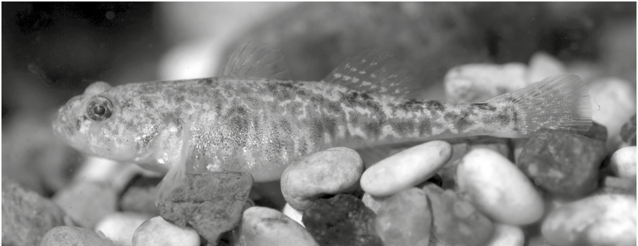
Fig. 4. Neretva dwarf goby Orsinigobius croaticus (TL = 41.7 mm), lower course of the Neretva River, Bosnia and Herzegovina.