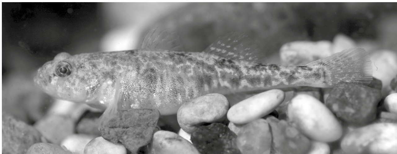
Fig. 4. Neretva dwarf goby Orsinigobius croaticus (TL = 41.7 mm), lower course of the Neretva River, Bosnia and Herzegovina.