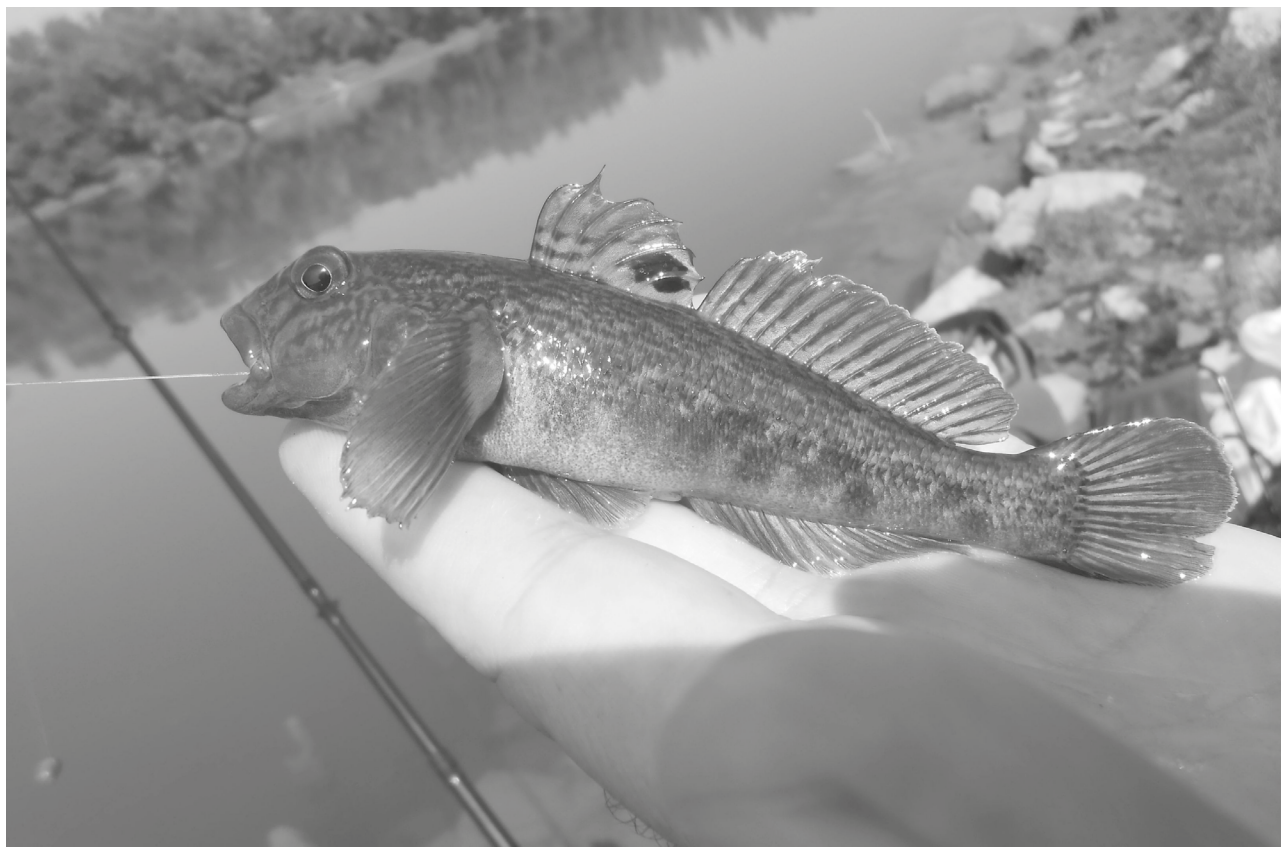
Fig. 3. Round goby Neogobius melanostomus from the Una River in Bosnia and Herzegovina (from Čolić et al. 2018; with the permission of Mr. Goran Šukalo).

Genus: Orsinigobius Gandolfi et al., 1986