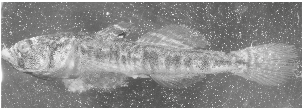
Fig. 2. Specimen from Hutovo Blato wetland, lower Neretva River catchment, firstly mentioned as unknown species (Ahnelt et al. 2009), but according to Šanda & Kovačić (2009) most probably Knipowitschia radovici.

Lake; Fig. 1). This species inhabits oligotrophic karst freshwaters in running and stagnant water, preferring silty habitats with sparse gravel and rocks (Šanda & Kovačić 2009, Tutman et al. 2013). It has been categorised as Vulnerable (VU; IUCN 2020), though it has not been assessed at the national level (Škrijelj et al. 2013).