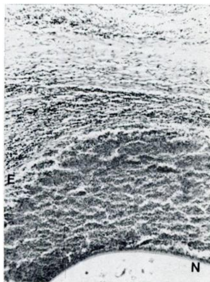
FIGURE 3. Eosinophils surrounding female D. insignis located in the leg of a raccoon. This worm has moved out of tissue capsule. X 95. E, eosinophils, N, nematode.

Microscopically, the affected tissues showed localized oedema with various amounts of fluid and, rarely, small haemorrhagic areas. The connective tissue capsule surrounding larvigerous females in the legs was interspersed with inflammatory cells. Sections of tissues surrounding near-emergent females showed inflammatory cells on superficial surfaces of muscles and, occasionally, degenerate muscle fibers. A purulent exudate, with a preponderance of eosinophils and neutrophils (Fig. 3),