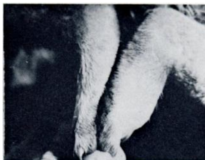
FIGURE 2. Swollen hind foot (on left) of a raccoon experimentally infected with D. insignis .

of hair was observed in animals which indulged in prolonged rubbing and/or scratching. Once the female worms were exhausted the raccoons rapidly recovered and showed no after effects.