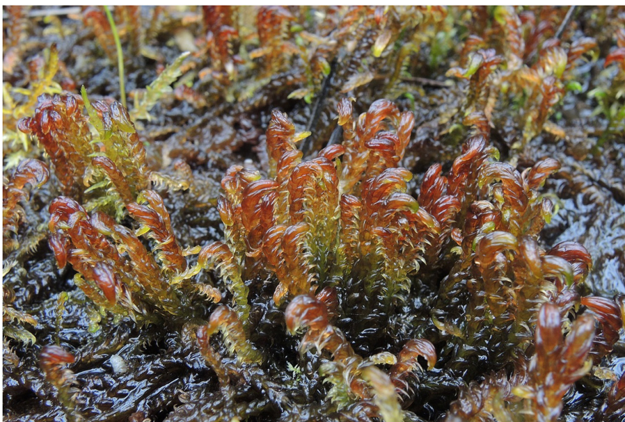
Figure 3. Hamatocaulis lapponicus in Viiankiaapa, Sodankylä.