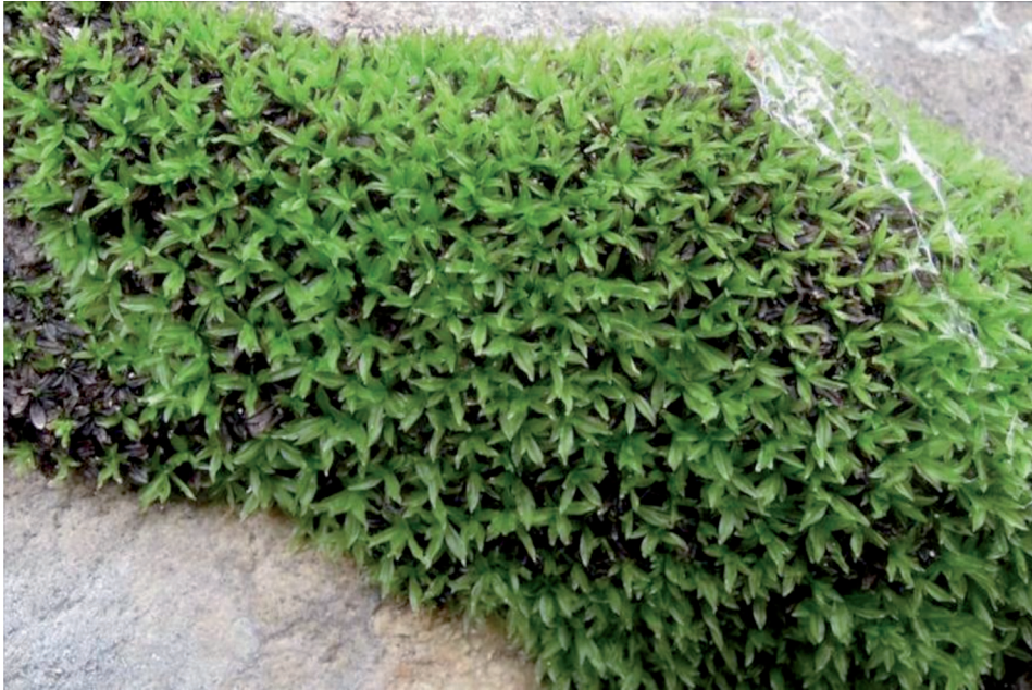
Figure 3. A moist patch of Scopelophila ligulata .