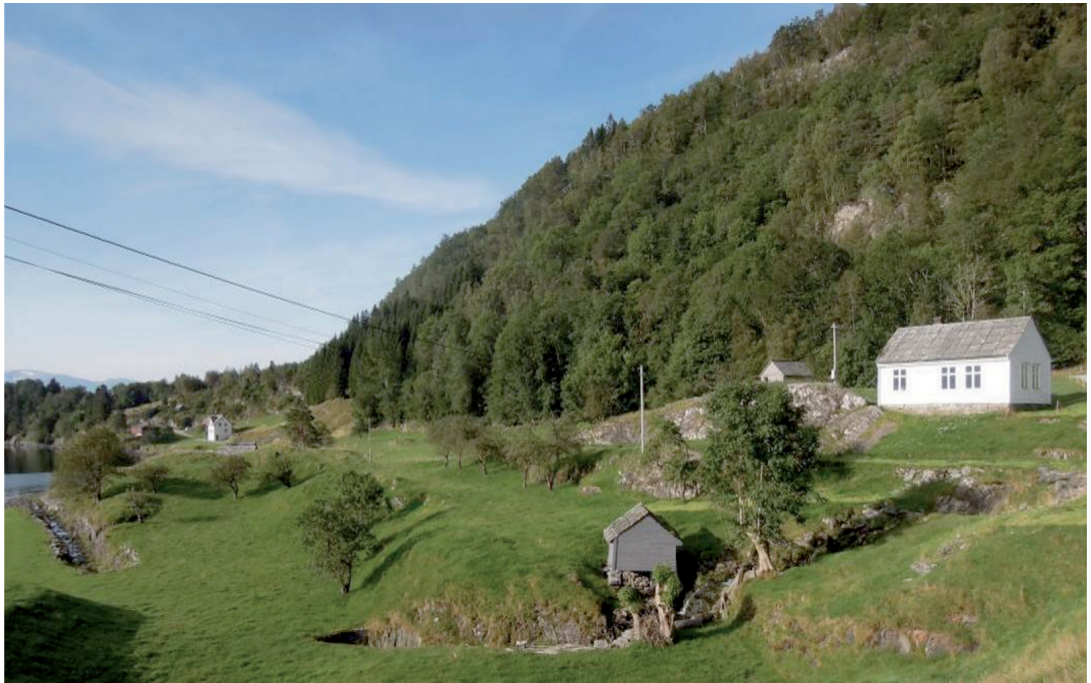
Figure 1. The steep slope with deciduous forest in which Scopelophila ligulata was first found.