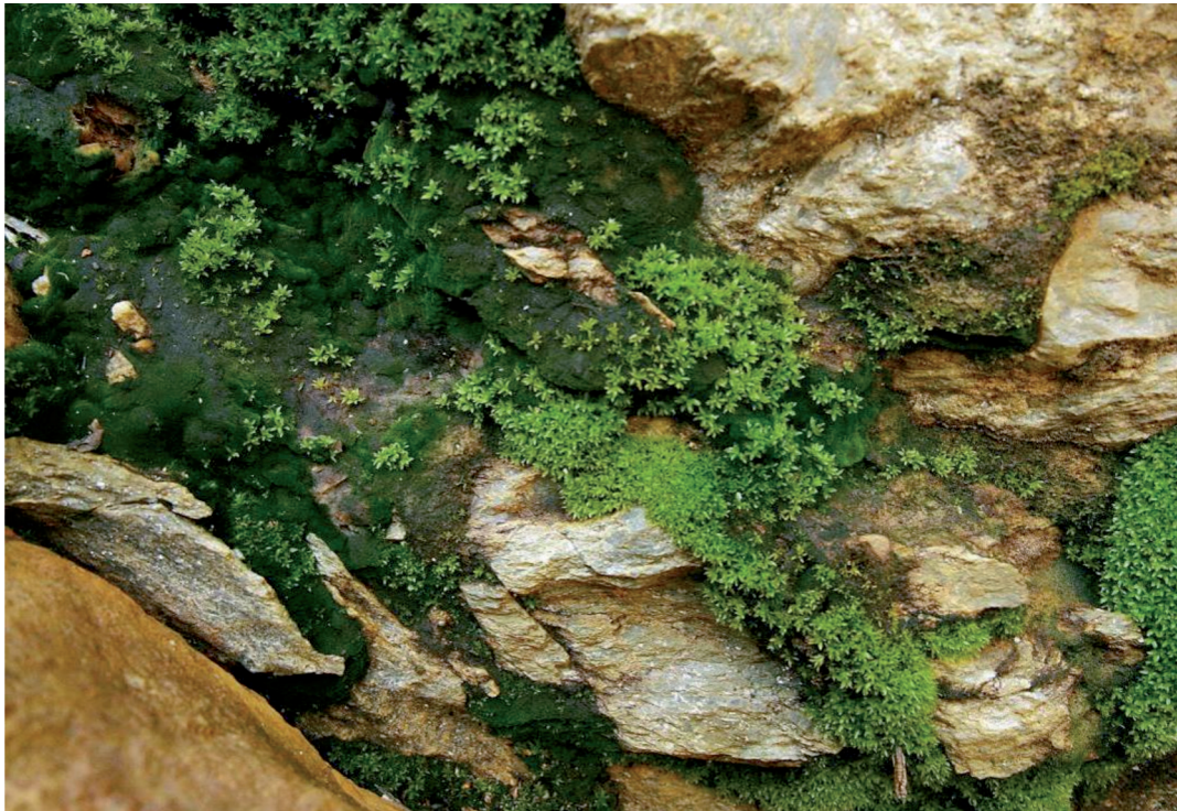
Figure 9. Mats of protonemata surrounding Scopelophila ligulata at the second site.

growing on this rock wall and by the brook close to S. ligulata were Brachythecium rivulare Schimp., Bryum pseudotriquetrum (Hedw.) G. Gaertn., B. Mey. & Scherb., Cratoneuron filicinum (Hedw.) Spruce, Dichodontium flavescens (Dicks. ex With.) Lindb., Ditrichum sp., Oxystegus tenuirostris (Hook. & Taylor) A.J.E. Sm., Palustriella commutata (Hedw.) Ochyra, Philonotis sp., Platyhypnidium riparioides (Hedw.) Dixon, Pohlia cruda (Hedw.) Lindb., Pohlia wahlenbergii (F. Weber & D. Mohr) A.L. Andrews, Scapania undulata (L.) Dumort., and Trichodon cylindricus (Hedw.) Schimp. This site is located at 60°06'17.6"N, 6°01'28.5"E (WGS-84), ca 30 m a.s.l.