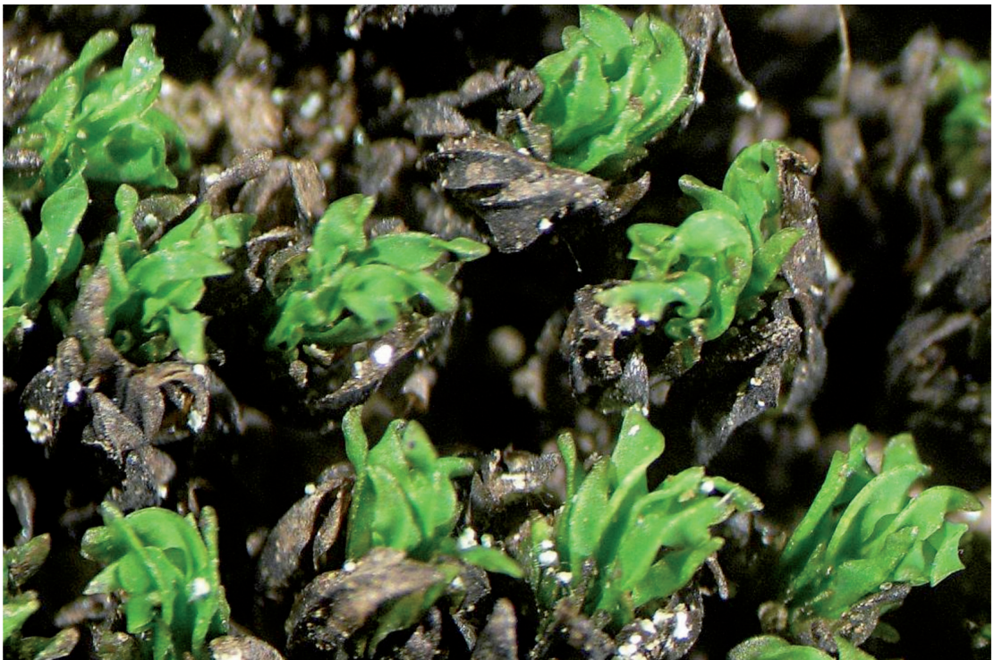
Figure 2. Dry plants of Scopelophila ligulata .