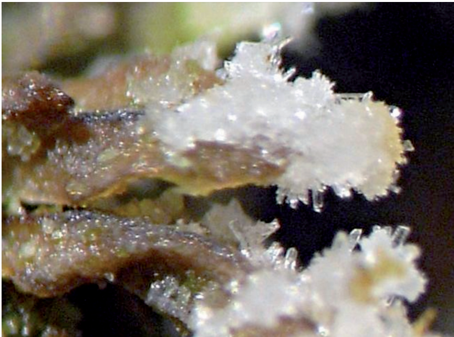
Figure 6. Crystals covering leaf tips of Scopelophila ligulata .