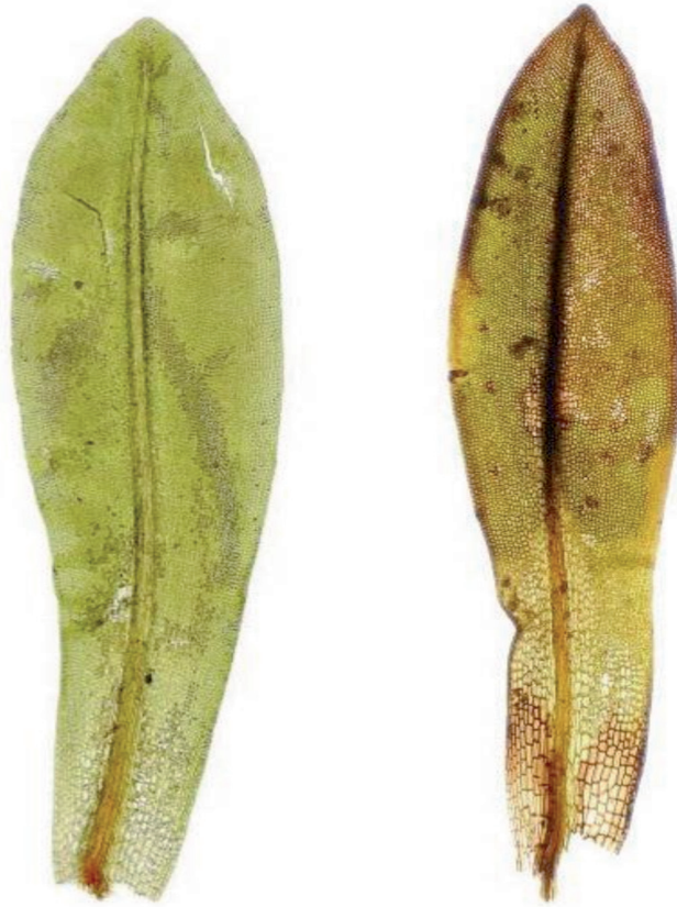
Figure 5. One young and one older leaf of Scopelophila ligulata . Note the indistinct border comprised of more thick-walled cells.