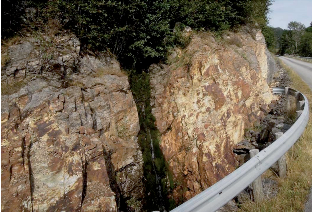
Figure 7. The yellowish-brown rock at the second site for Scopelophila ligulata on Varaldsøy.