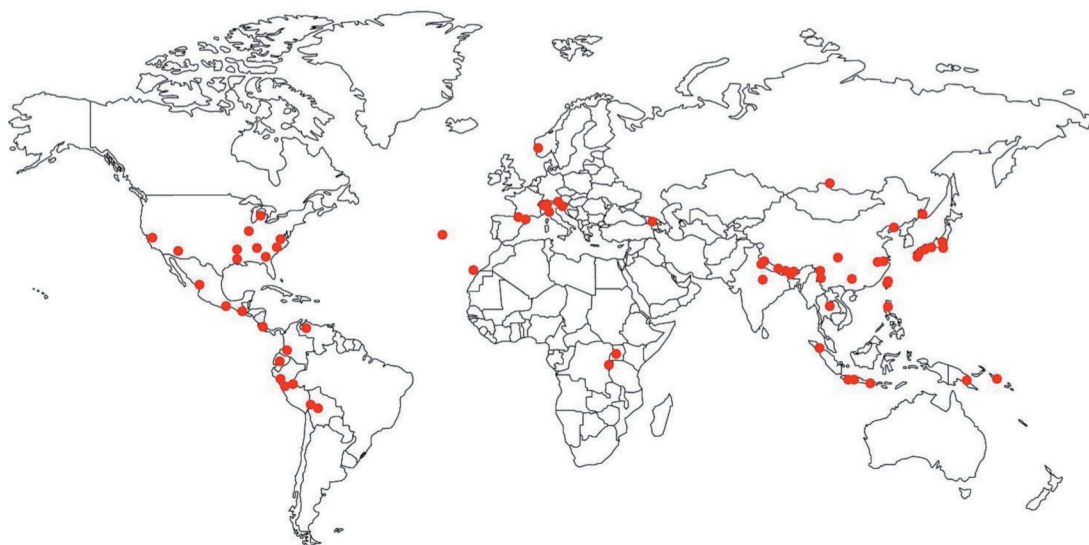
Figure 10. World distribution of Scopelophila ligulata .

Copper mosses have traditionally been considered to be more or less restricted to substrates with high concentrations of copper and/or other heavy metals. The substrates of several species have been analysed (Mårtensson and Berggren 1954, Shacklette 1967, Shaw and Anderson 1988), but the results are inconsistent and the relationships between plants and substrates have not been fully resolved. It has been proposed that the acidity of the substrate, rather than the metal ion content, is the abiotic factor that favours the occurrence of copper mosses (Hegi 1927, Persson 1948). A low pH is indeed common for the majority of analysed substrates, presumably caused by oxidation of reduced sulphur to sulphuric acid. Schatz (1955) suggested that sulphur might be the determinant factor for the occurrence of copper mosses, and that it would