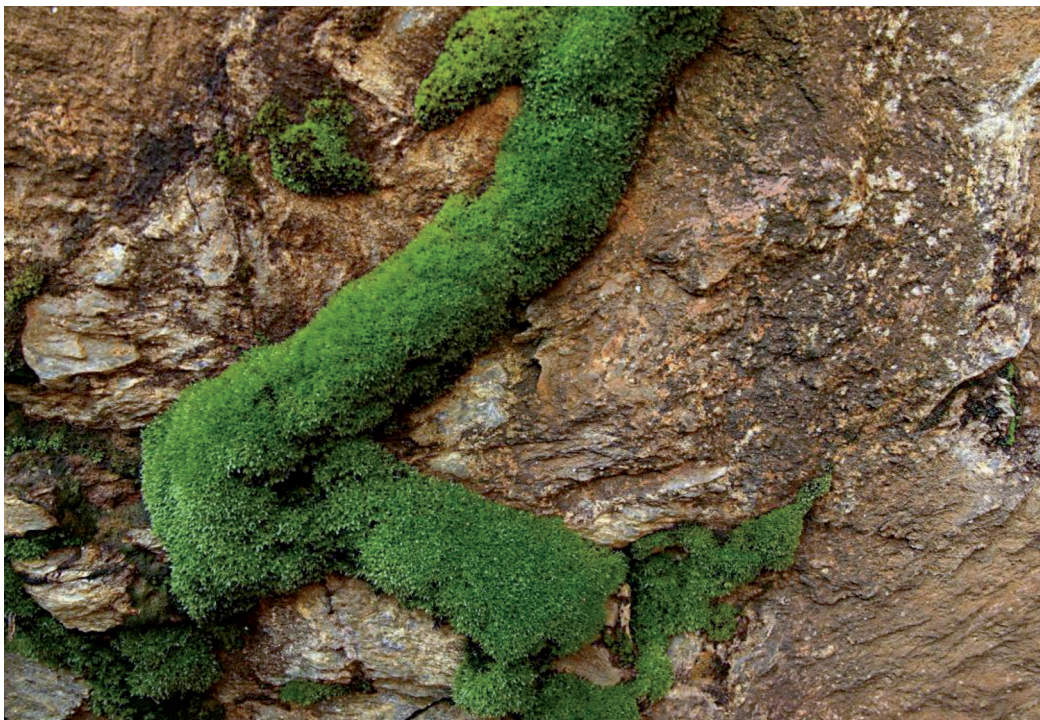
Figure 8. Scopelophila ligulata growing in cracks at the second site.