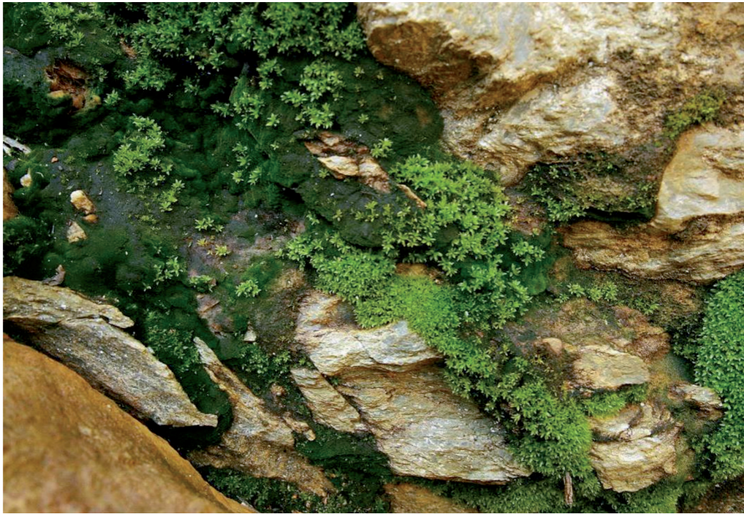
Figure 9. Mats of protonemata surrounding Scopelophila ligulata at the second site.

growing on this rock wall and by the brook close to S. ligulata were Brachythecium rivulare Schimp., Bryum pseudotriquetrum (Hedw.) G. Gaertn., B. Mey. & Scherb., Cratoneuron filicinum (Hedw.) Spruce, Dichodontium flavescens (Dicks. ex With.) Lindb., Ditrichum sp., Oxystegus tenuirostris (Hook. & Taylor) A.J.E. Sm., Palustriella commutata (Hedw.) Ochyra, Philonotis sp., Platyhypnidium riparioides (Hedw.) Dixon, Pohlia cruda (Hedw.) Lindb., Pohlia wahlenbergii (F. Weber & D. Mohr) A.L. Andrews, Scapania undulata (L.) Dumort., and Trichodon cylindricus (Hedw.) Schimp. This site is located at 60°06'17.6"N, 6°01'28.5"E (WGS-84), ca 30 m a.s.l.