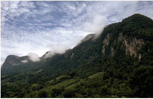
FIG. 3. Study Area 3. View of Cerro Rabón from Jalapa de Díaz where a member of the walnut family is among the dominant trees.

grandiflora , Myriocarpa longipes , and Psychotria fruticetorum .