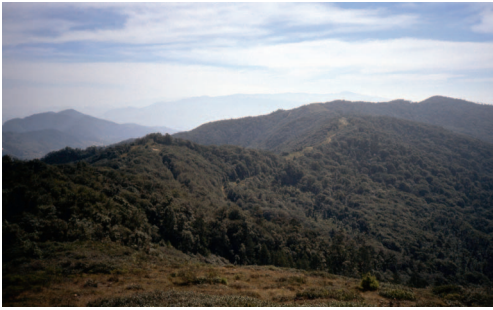
FIG. 2. Aspect of Study Area 1. View from Cerro Pelón, Sierra de los Frailes. Several species of oaks are common in this area.

canus , Phyllonoma laticuspis , Prunus brachybotrya , and Ternstroemia tepezapote , among others. These forests have a canopy of 20–30 m (65–100 ft) and do not present a significant understory except for the areas where they may have been disturbed by human activities, or where there are gaps in the vegetation due to natural events (i.e., falling of trees). In the fringes of the forests and along the highway, many Asteraceae herbs can be found including Dahlia australis and Senecio callosus .