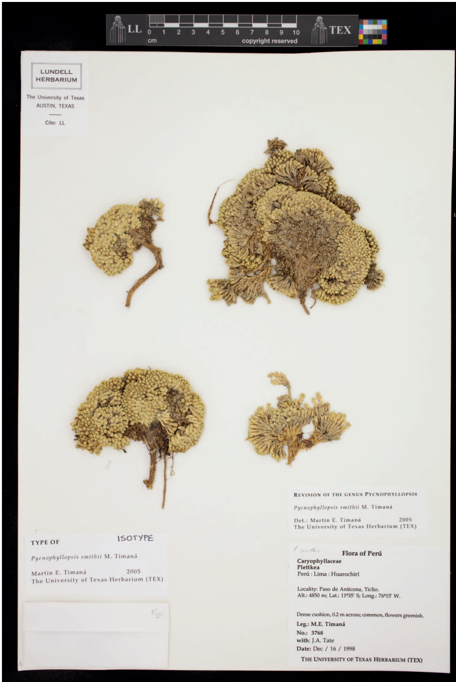
FIG. 2. Isotype of Pycnophyllopsis smithii . — The University of Texas Herbarium (LL).