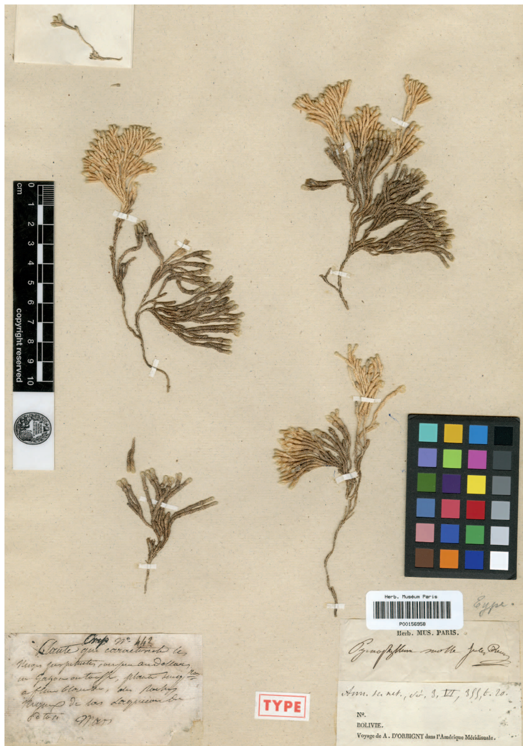
FIG. 3. Lectotype (P 00156958) of Pycnophyllum molle . — Reproduced by kind permission, © MNHN collection-Paris.