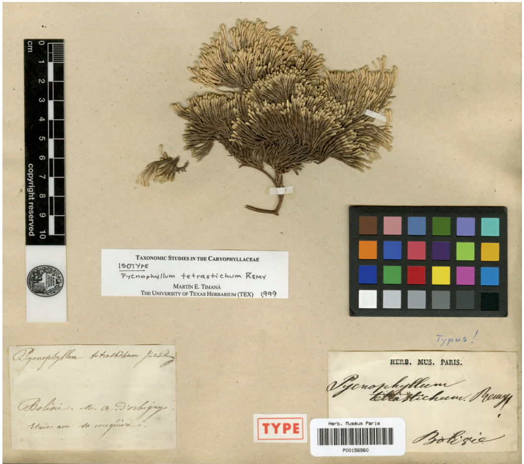
FIG. 5. Lectotype (P 00156960) of Pycnophyllum tetrastichum .

designated here: MOL!; ISOLECTOTYPES: G!, US!).