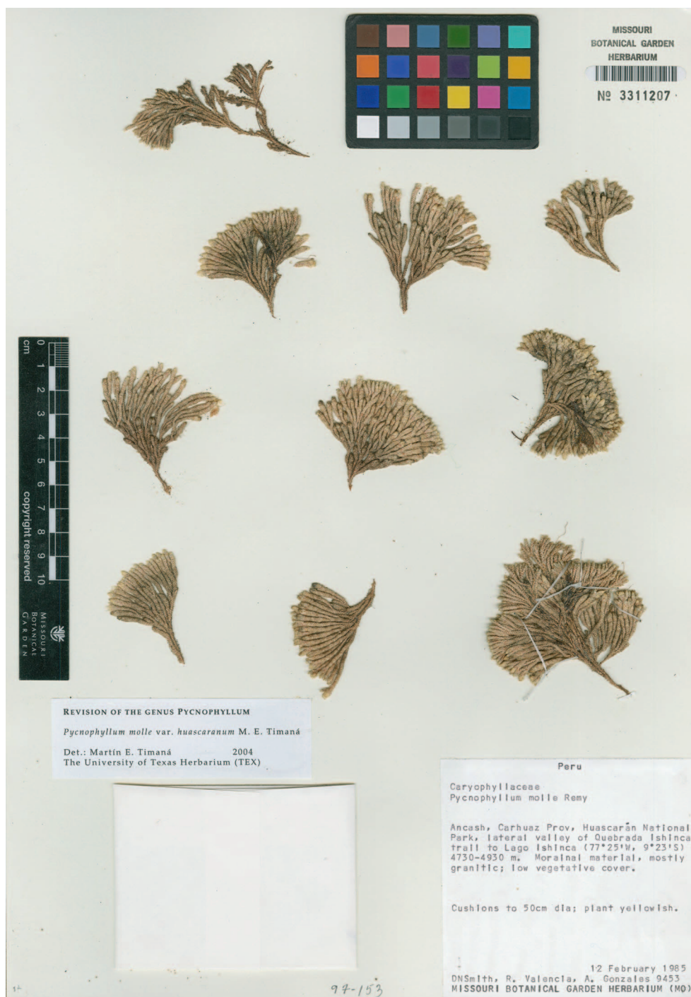
FIG. 4. Holotype (MO 3311207) of Pycnophyllum huascararum .