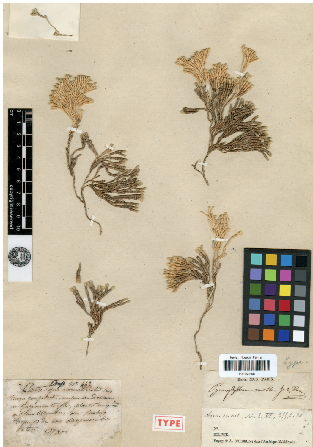
FIG. 3. Lectotype (P 00156958) of Pycnophyllum molle .