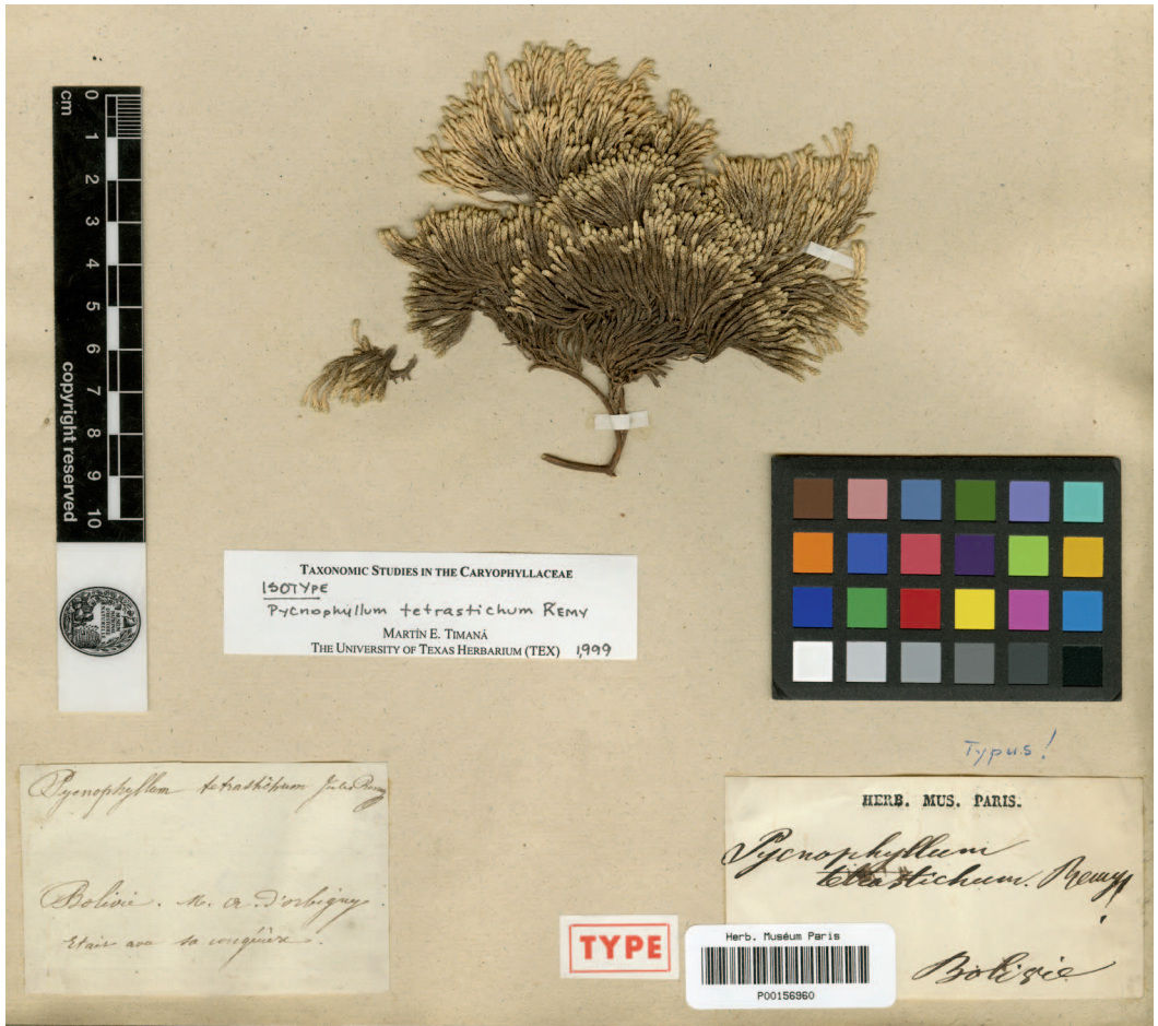
FIG. 5. Lectotype (P 00156960) of Pycnophyllum tetrastichum . — Reproduced by kind permission, © MNHN collection-Paris.

designated here: MOL!; ISOLECTOTYPES: G!, US!).