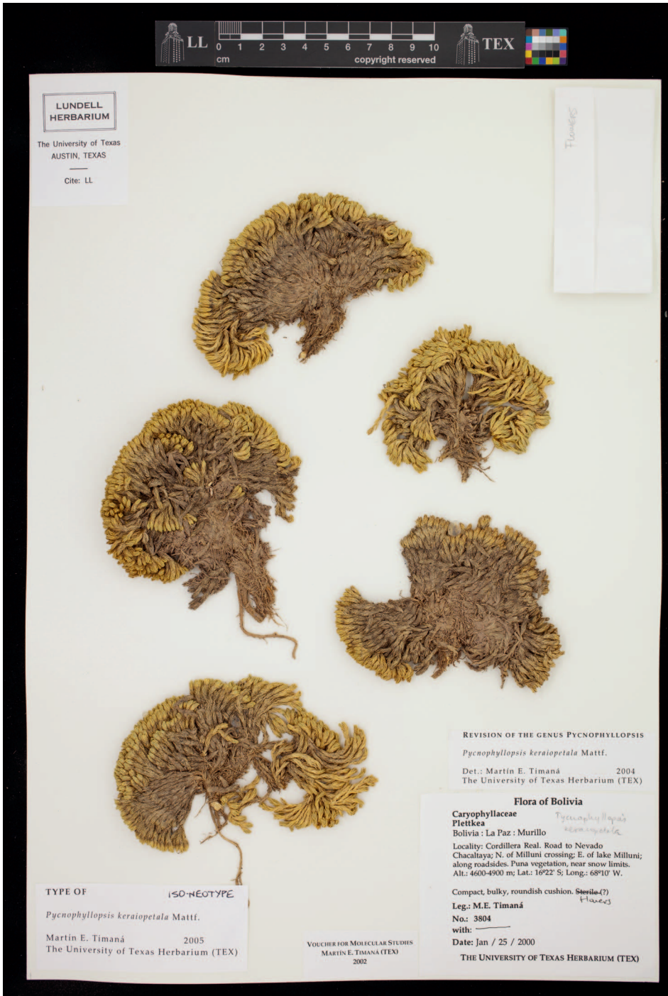
FIG. 1. Isonotype of Pycnophyllopsis keraipetala . —The University of Texas Herbarium (LL).