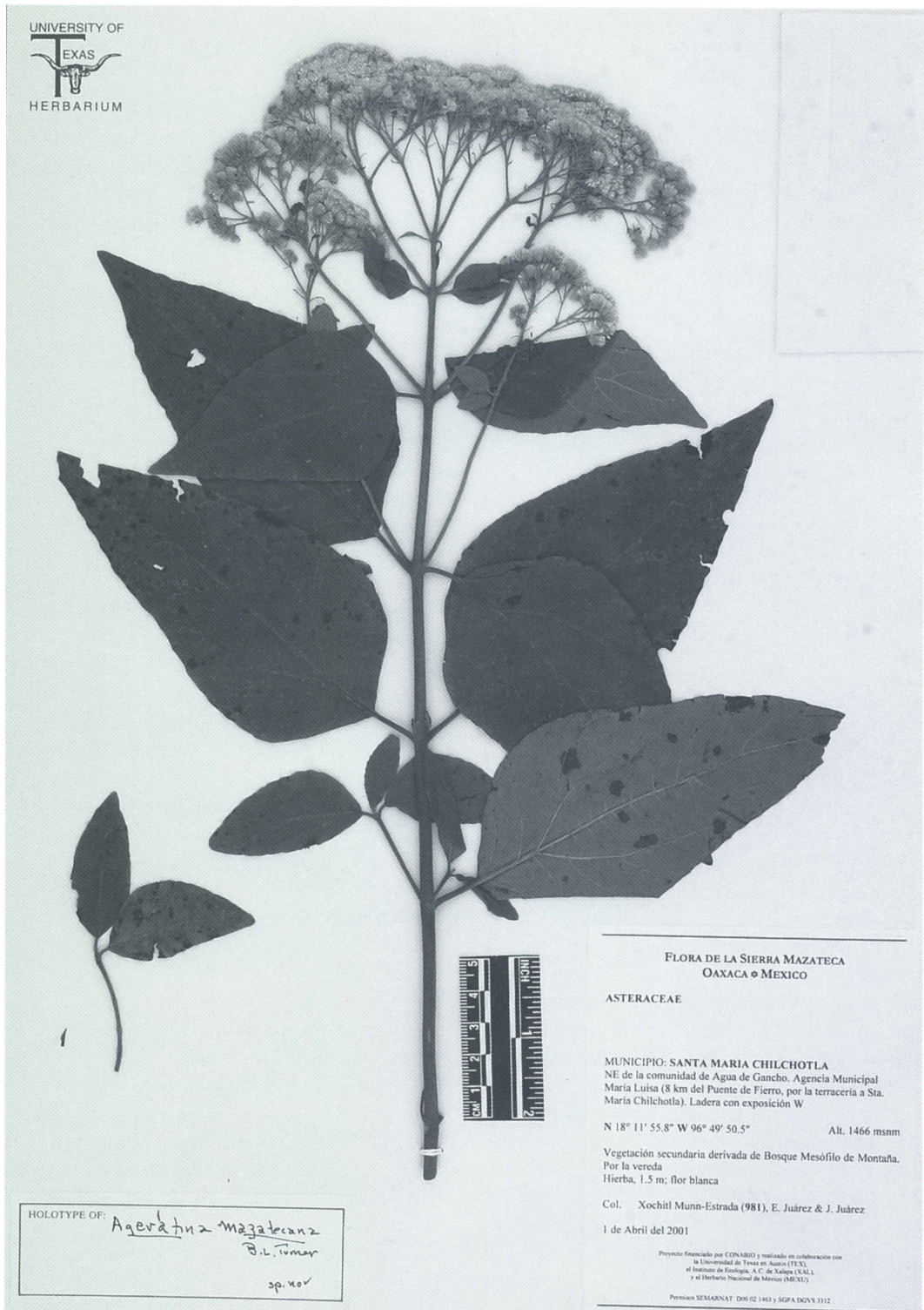
FIG. 2. Holotype of Ageratina mazatecana .