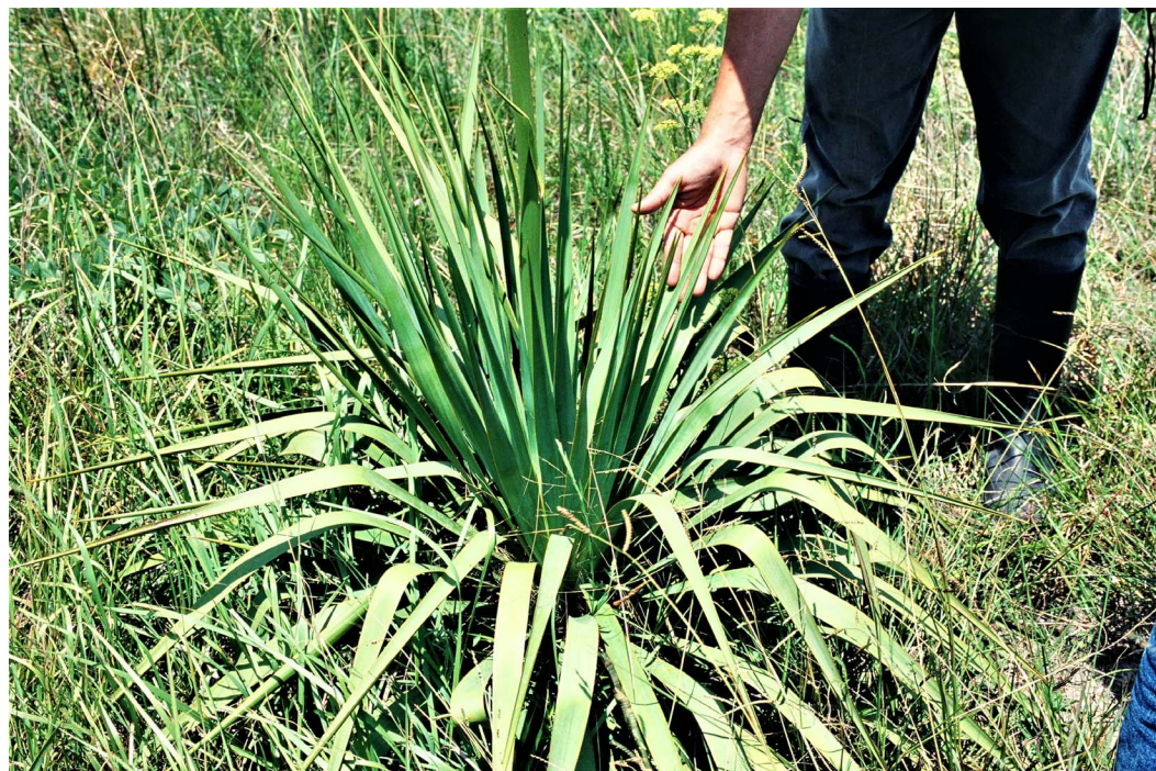
FIG. 4. Leaf rosette (Clary 432) [TEX-LL]. Chocolate Bayou, Brazoria National Wildlife Refuge.

Y. treculeana (iNaturalist obs. 24312828 and 221194239), near Mad Island WMA, Matagorda Co., the southern end of the range of Y. carrii .