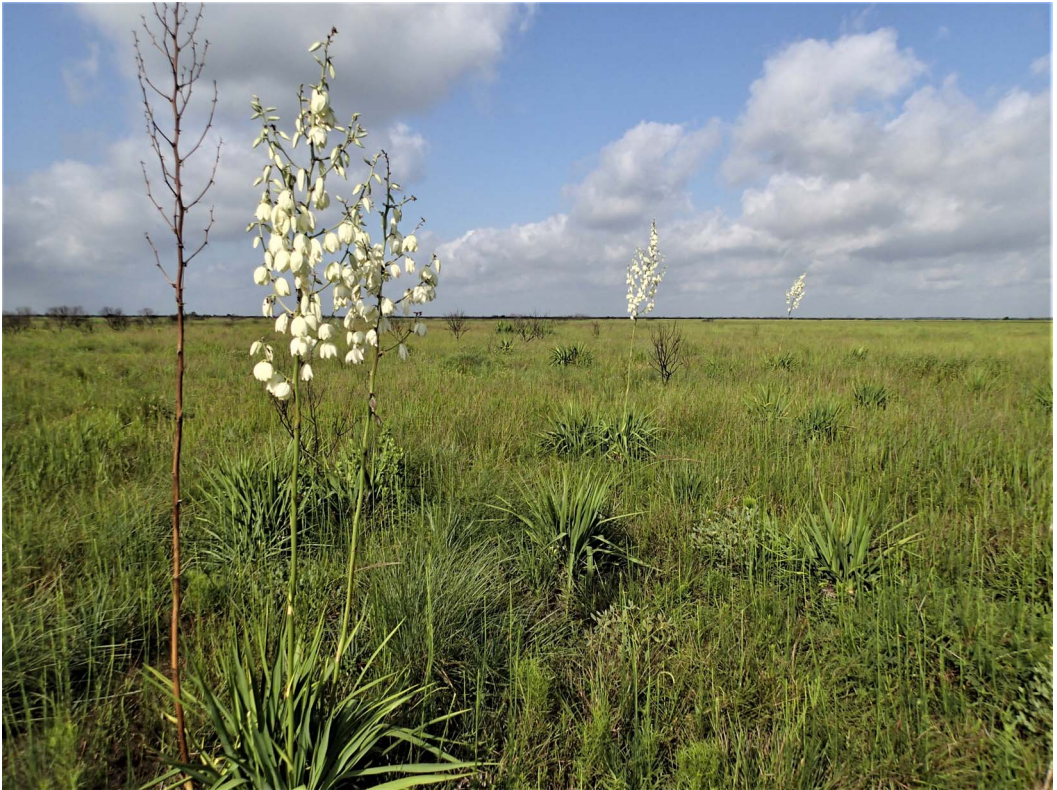
FIG. 3. Habit. Yucca carrii population, Brazoria National Wildlife Refuge.

Benth., Sambucus sp., Verbena stricta Vent., Hibiscus laevis All., Rubus sp., Ibervillea sp., Passiflora incarnata L., Vitis mustangensis Buckley, Campsis radicans (L.) Seem. ex Bureau, Borrhichia sp., Cuscuta sp., Cissus sp., Spartina spartinae (Trin.) Merr. ex Hitchc., Schoenoplectus americanus (Pers.) Volkart ex Schinz & R. Keller, Phragmites sp., Sorghum halepense (L.) Pers., Elymus canadensis L., Chloris sp.