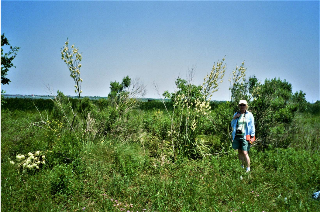
FIG. 2. Yucca carrii type locality. (Clary 427 [TEX-LL]). Texas Nature Conservancy (TNC) Texas City Prairie Preserve.

Galveston, scattered around San Leon on the north side of Dickinson Bayou (about 30 plants total), along the Texas City sea wall and the TNC Texas City Prairie Preserve (about 40 plants total; Fig. 2); Chambers, on the banks of Cotton Lake (about 10 plants); Brazoria, on the south side of Chocolate Bayou (about 50-100 plants), Brazoria National Wildlife Refuge (BNWR) (Fig. 3). Plants have been identified by photograph in Harris Co., the San Jacinto Battleground State Historic Site (Eric Keith), and Brazoria, Galveston and Matagorda counties (iNaturalist.org, https://www.inaturalist.org ). Limited surveys on existing roads have been undertaken to find more populations in similar habitat along the coast in Galveston (Galveston Bay, Galveston Island) and surrounding Chambers (Anahuac National Wildlife Refuge), Harris and Matagorda (San Bernard National Wildlife Refuge, Big Boggy National Wildlife Refuge) counties, but none have been found.