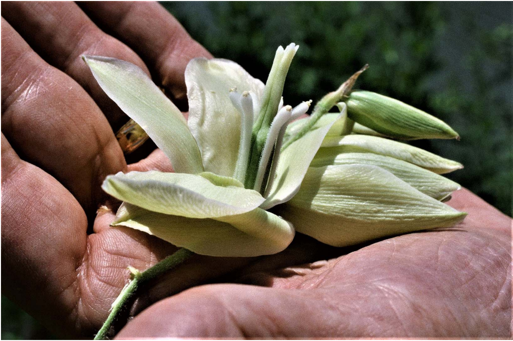
FIG. 5. Flower (Clary 418 [TEX-LL]). Dickinson Bayou and SH 146, Galveston Co.

pollination experiments has yielded fruit set (see Appendix, Pollination Experiments). Yucca moth larvae were translocated from Burnet and Lampasas counties to the BNWR population (2018) and in situ hand pollination efforts were made. Plants were translocated from BNWR to an area with live moth populations in Travis County, TX. No fruits have been produced to date.