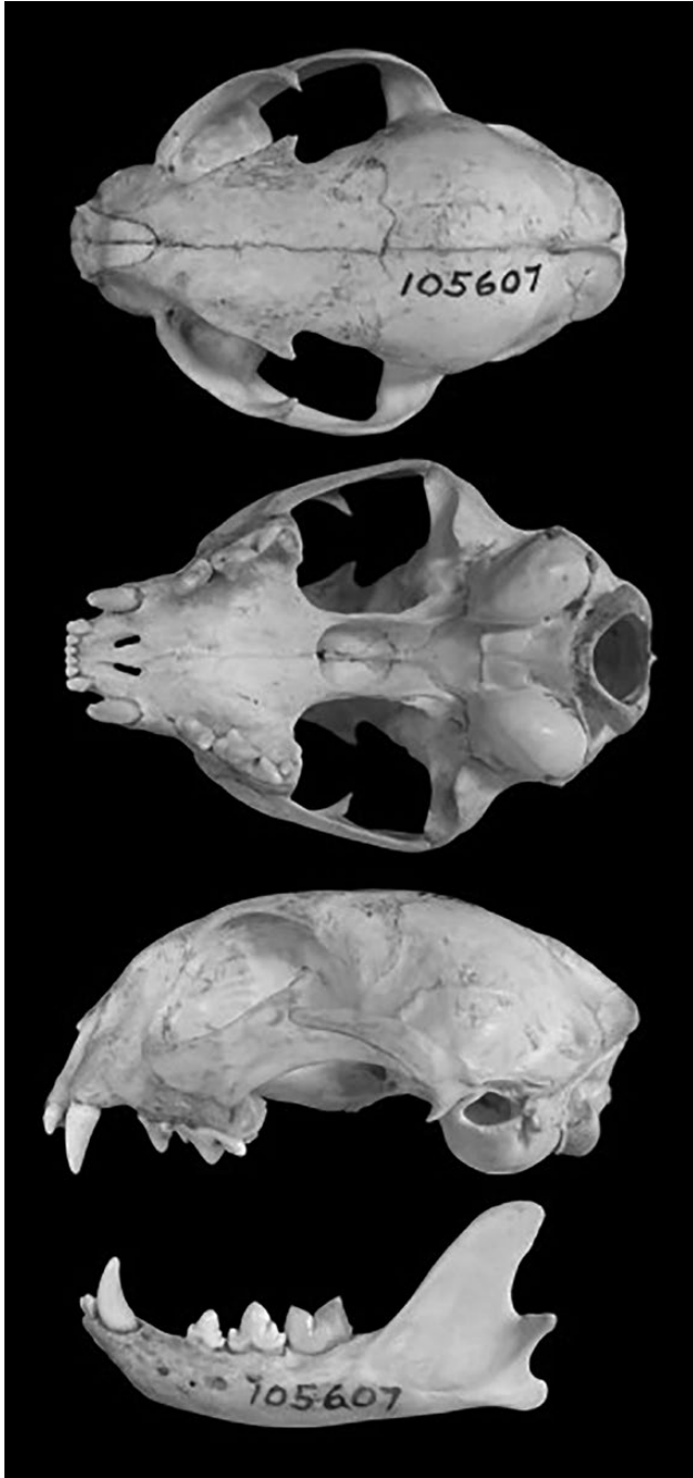
Fig. 3. —Dorsal, ventral, and lateral views of skull and lateral view of mandible of an adult female Caracal caracal (FMNH [Field Museum of Natural History] 105607) collected by H. H. Hoogstraal (collector # 13919) on 9 December 1972 at Africa, Sudan, Kassala, Ethiopian: Kassala, Abu Gamal. Total skull length is 103.52 mm. f8e611ef-14e0-431f-acd8-8955c8521c97 Field Museum of Natural History (Zoology) Mammal Collection. https://collections-zoology.fieldmuseum.org/catalogue/2604376 .

2010). Females likely do not begin mating until 14 months of age and can remain reproductive until 18 years of age (Furstenburg 2010). Females are polyestrous and estrus cycles last anywhere from 1 to 6 days (Nowell and Jackson 1996).