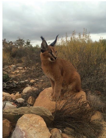
Fig. 1. —Subadult Caracal caracal from Anysberg Nature Reserve, South Africa.

CONTEXT AND CONTENT. Order Carnivora, suborder Feliformia, family Felidae, subfamily Felinae. The genus Caracal includes the following two species: Caracal aurata (formerly Profelis aurata ) and C. caracal (Kitchener et al. 2017).