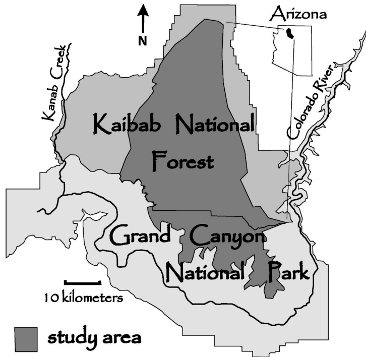
Fig. 1. Map showing the vicinity of the Kaibab Plateau and the area studied.

The lower elevational limit for this checklist is somewhat arbitrary, with the intention of capturing the unique flora of the upper elevations of the KP and lower portion of the ponderosa pine–Douglas-fir communities. By so doing, we included steep xeric and mesic terrain below the rim as well as hanging gardens. With the exception of the higher regions of the Powell Plateau, high buttes or mesas within GRCA were not included. The boundary of our study area (Fig. 1) is well defined by the upper portions of the rim of the Grand Canyon; where that rim falls below the ponderosa pine zone on the west, our boundary follows the Winter Road (FRs 425, 427, and 423 to FR 22). The boundary continues, making a northern arc with a radius of 8–10 km around Jacob Lake at the lower level of the ponderosa pine zone to the East Side Game Road (FR 220), through Saddle Mountain Wilderness and to the east rim of the KP. Although Rasmussen (1941) places the lower elevational limit of the KP at 1830 m (6000 ft) with an area of 95 km (60 mi) by 55 km (35 mi) and 2980 km 2 (1152 mi 2 ), our study area is ca. 1880 km 2 (725 mi 2 ).