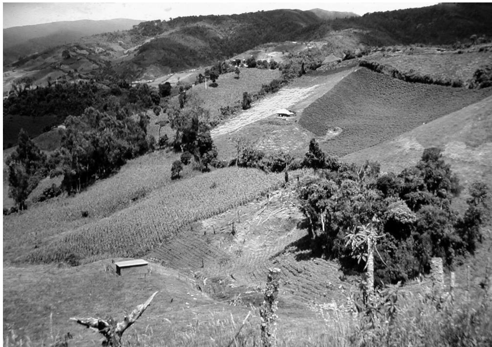
FIGURE 3 A panoramic view of the rural landscape showing the heterogeneity of land uses and the prominence of potato and corn cultivation. Note native trees surviving along the hedgerows, steep brooks, and other areas unsuitable for agriculture or grazing.

The expanding population and opening of new agricultural lands do not appear to have greatly affected the páramo border in the eastern range within the study site. A continuous 50-km stretch of intact forest