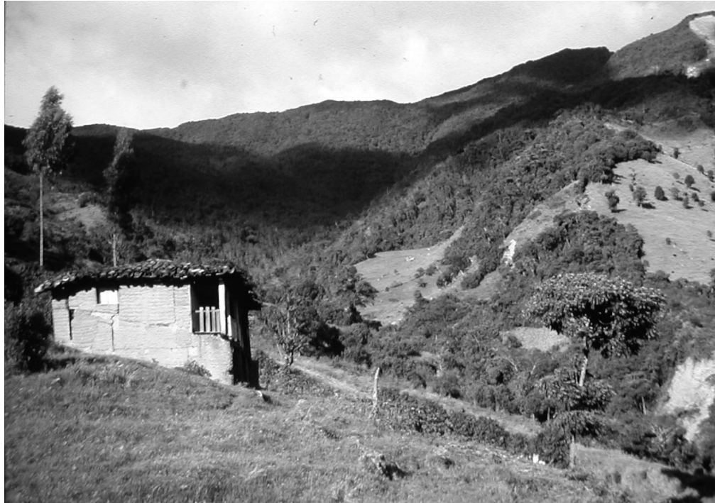
FIGURE 2 A view of the rural landscape of Carchi province, where human activity encroaches on the TMCs and expands the agricultural frontier, thus raising the lower limit of the tree line. Past activity has been more important in forming the páramo and the upper tree line. Past and current pressures make protection of cloud forest remnants crucial in this area.

forests still survive in isolation above 3800 m (Sarmiento 1988) around Chique Lake. The climate pattern, typical of the tropics, is characterized by generally uniform temperatures the year round (mean temperature 12°C) and 2 distinctive moisture regimes—a rainy season with mean precipitation of 2700 mm/year and a dry season with mean precipitation of 520 mm/year (Cañadas-Cruz 1983). Isolated “islands” of páramo display typical grass-