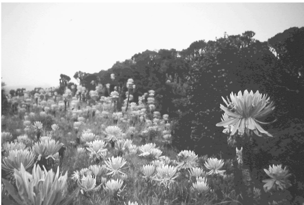
FIGURE 4 Distinctive anthropogenic boundary between the forest and the páramo in Nueva America. Note the straight line of the slope cut and the avoidance of ravines and brooks not suitable for grazing or agriculture. Often, semicircular shapes are observed as evidence of previous kilns for charcoal extraction.

The notion of anthropogenic community composition, landscape structure, and ecosystem function is a viable succinct explanation for Andean tree line dynamics, both in the upper and lower boundaries of the native TMCFs (Figure 4). The simplified, temperate-based view of altitudinal vegetation belts moving up and down