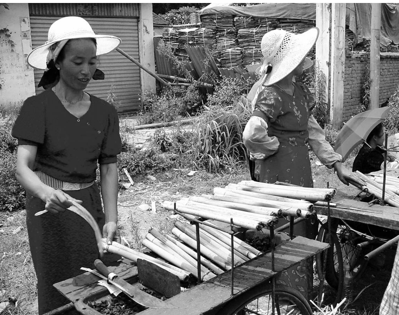
FIGURE 3 Dai women cooking rice in Cephalostachyum pergracile containers.

nan's varied environments, which provide excellent growing conditions for bamboo. There are about 75 genera and 1250 bamboo species in the world. Of the nearly 500 species in 40 genera present in China, mostly in the monsoon areas south of the Changjiang River, over 250 bamboo species in 29 genera occur naturally in Yunnan.