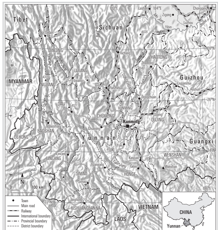
FIGURE 1 Map of Yunnan Province. (Map by Andreas Brodbeck)

The province of Yunnan is situated in southwest China. It covers an area of 394,000 km 2 . It neighbors Guizhou and Guangxi provinces in the east, Sichuan province in the north, and Tibet in the northwest, and has state borders with Myanmar in the west and southwest, as well as Laos and Vietnam in the south (Figure 1). Yunnan is a transition area between south China and the eastern Himalayas. In Yunnan, 3 major Asian climate zones come together: the tropical monsoon zone of South Asia, the subtropical monsoon zone of East Asia, and the Qinghai-Tibetan Plateau zone. This accounts for Yun-