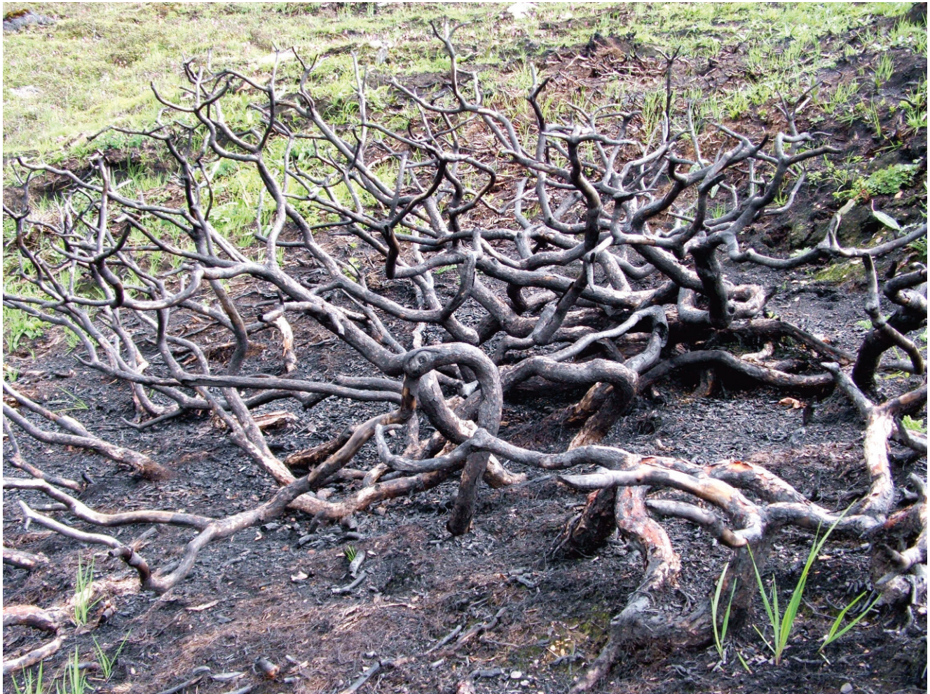
FIGURE 1 Rhododendron shrubs above 4100 m altitude at Soe Yaksa after prescribed burning.

prescribed burning can lead to 4.5 times as much carrying capacity as cutting or no treatment. The estimated carrying capacity after prescribed burning was also higher than the 0.10 livestock unit per hectare previously estimated for high-altitude regions (Dorjee 1986).