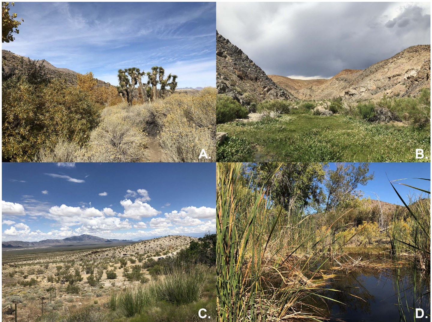
Figure 2. —Photographs of four desert springs sampled. (A) Lower Centennial Spring, Inyo County. (B) Miller Spring, Inyo County. (C) Wildhorse Spring, San Bernardino County. (D) Vaughn Spring, San Bernardino County.

In contrast, of the 296 upland plant taxa we documented, only 6.7% were nonnative taxa, and their life forms primarily consisted of annual herbs (54%), shrubs (19.8%), and perennial herbs (15.8%) (Supplemental Data Table 1). Asteraceae was the most species-rich family among upland taxa (21.6%).