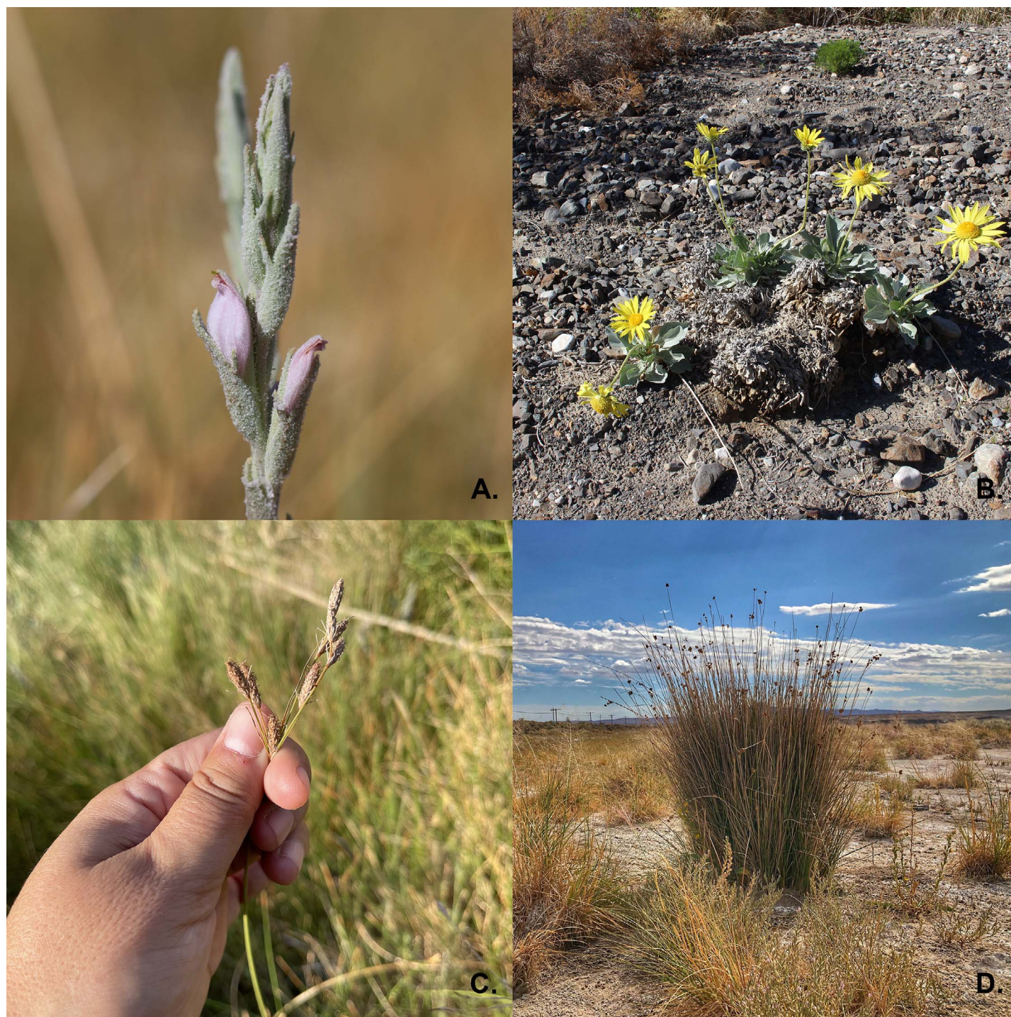
Figure 4. —Selected rare plants documented as a part of this study. (A) Chloropyron tecopense (Orobanchaceae). (B) Enceliopsis covillei (Asteraceae). (C) Fimbristylis thermalis (Cyperaceae). (D) Juncus cooperi (Juncaceae).

and dominate habitats (Curtis and Bradley 2015; Brooks et al. 2016).