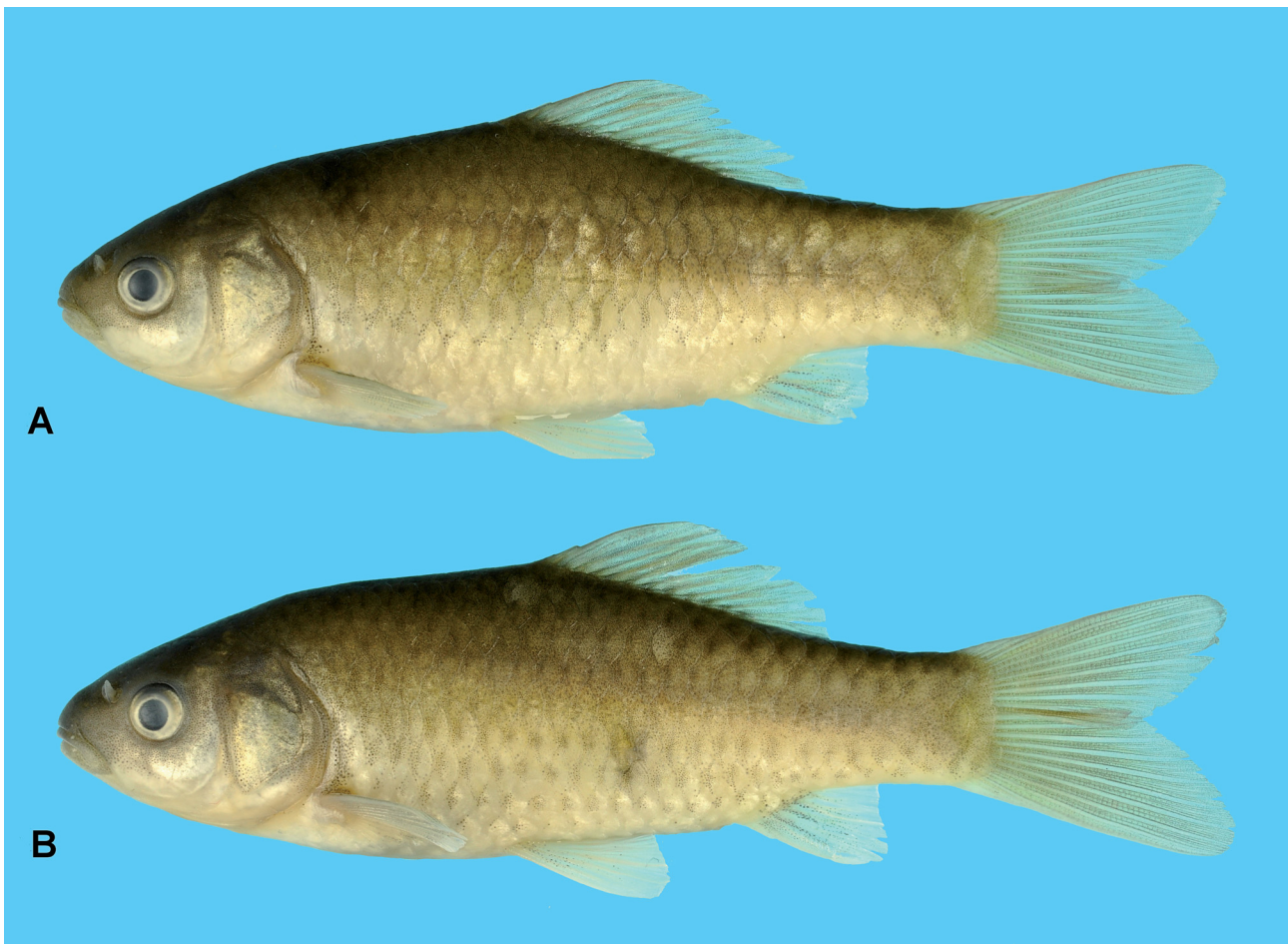
Fig. 1. Carassius praecipuus ; Laos: Nam Ngum drainage: Nam Chat. (A) MHNG 2767.087, holotype, 55.6 mm SL. (B) CMK 22746, paratype, 62.0 mm SL (reversed).