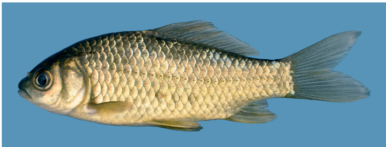
Fig. 5. Carassius auratus , CMK 25714, 68.4 mm SL; Laos: Houaphan Province: Nam Ma drainage.

The material of the new species was obtained during a survey conducted in connection with an Environmental Impact Assessment of the Nam Ngum 3 hydropower project. It is a pleasure to thank François Obein for