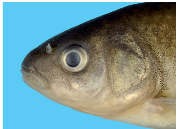
Fig. 2. Carassius praecipuus CMK 22746, paratype, 62.0 mm SL; head (reversed). ▶

straight line to dorsal-fin base, then more or less straight to caudal-fin base. Caudal peduncle 1.3-1.4 times longer than deep. Interorbital area convex. Head longer than deep, dorsal profile straight; ventral profile arched from mouth to pelvic-fin base, then straight to anal-fin origin; snout blunt. Mouth terminal to subterminal, anteriormost point of cleft below level of lower margin of eye, upper lip slightly projecting beyond tip of lower jaw. Lower jaw-quadrangle junction about at vertical of anterior margin of eye. 10+10 (1), 10+11 (4*) or 11+10 (1) = 20-21 gill rakers on first gill arch, their length about 1-1.5 times width of arch and about 3-4 times in length of gill filaments at same position.