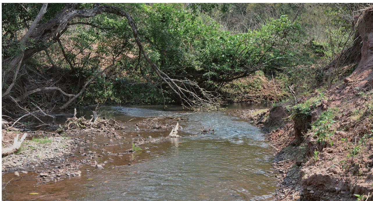
Fig. 4. Nam Chat upstream of Ban Houay Sod, Xiangkhouang Province, Laos, 1142 masl; 29 February 2012. Type locality of Carasius praecipuus . Most specimens were obtained in the pool at the rear.

Szczerbowski (2002: 7) compiled a list of counts from the literature for C. gibelio (Bloch, 1782). The cumulated variation is 12-19 (apparently =12-19½ in my notation); 12 is reported only in the range 12-18 for a population from Yakutia. Noteworthy is that this Yakutia sample also has the lowest reported lateral line scale count, with 27-35 scales, while others have 28-33. The count supposedly includes the scales on the caudal-fin base (see below) but one cannot be certain since this is a compilation from disparate sources. The reported range of variability of the counts in this Yakutia population is very wide and makes the data suspicious. A variability range of 7 rays for a population with an average 15 rays is something otherwise unknown in cyprinid fishes in which the usual range in species with short dorsal fin would be 2-3 rays (and often no variability); this suggests a serious problem and poor reliability. In any case, C. praecipuus is distinguished from C. gibelio in having 20-21 gill rakers on the first gill arch (vs. 35-54) and a much smaller size (largest known specimen 62 mm SL, vs. 350 mm