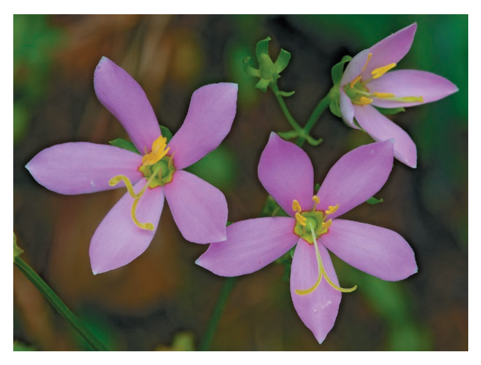
Figure 2. Flower of Sabatia angularis (L.) Pursh. The Gentianaceae were a focus of Dr. Wilbur's work.

1989b) and of the cryptic botanical works of Constantine Rafinesque (1783–1840). Rafinesque studied Sabatia among many other genera, and he left a complicated plant taxonomy for later botanists to tease apart and a large set of names of problematic status under the rules of the current International Code of Nomenclature for algae, fungi, and plants (Turland et al. 2018). Rafinesque has been poorly regarded and heavily criticized as both a person and a taxonomist, and his work interested Wilbur partly because the names presented a complex nomenclatural puzzle with aspects both of botany and southern history, and partly because Wilbur's first reaction was always to stand up for the disregarded Southern underdog—and Rafinesque surely qualified as one.