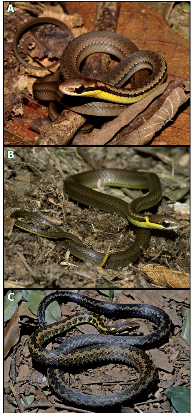
Figure 1. Species analyzed in the present study: (A) Echinanthera cephalostriata, (B) E. cyanopleura, and (C) E. undulata.

esis, which predicts a higher breakage frequency in males, which presumably present higher mobility during the mating season and are, therefore, more susceptible to predation (Vitt et al., 1974; Bonnet et al., 1999); (2) the size hypothesis, which predicts a higher breakage frequency in larger—and theoretically older—specimens compared to smaller ones, since the former would have probably been exposed to more predation attempts during a proportion-