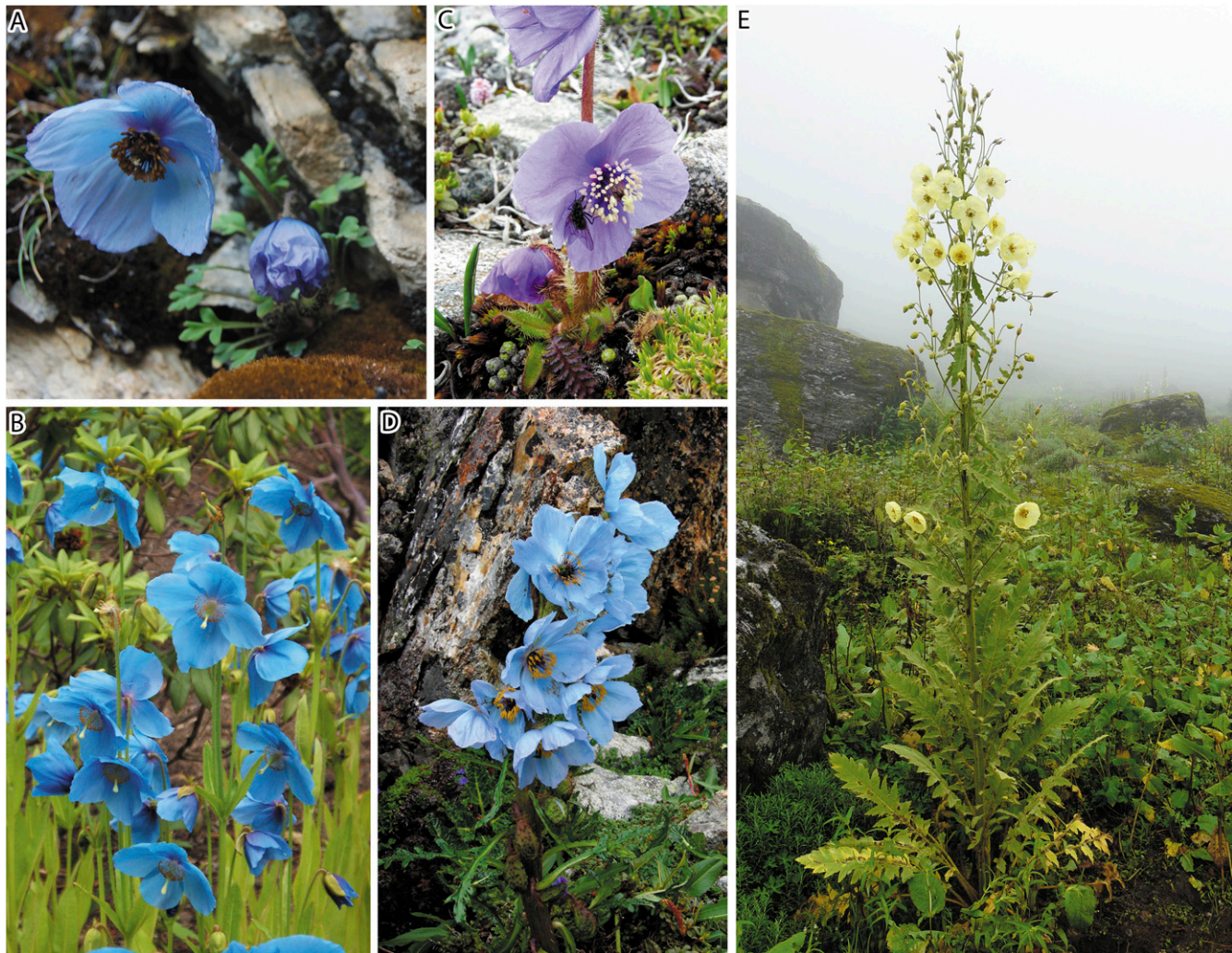
FIG. 2. Morphological overview of a species in each of the proposed Meconopsis sections. A. M. bella (in M. sect. Primulinae ). B. M. grandis cultivar (in M. sect. Grandes ). C. M. sp. (in M. sect. Aculeatae ) (possibly a hybrid between named species). D. M. speciosa (in M. sect. Aculeatae ). E. M. paniculata (in M. sect. Meconopsis ).

manually. Concatenated cpDNA data was analyzed using MrBayes v3.1.2 (Huelsenbeck and Ronquist 2005). Partition analysis was conducted for the combined cpDNA dataset with each cpDNA marker treated as a separate partition. The evolutionary models of nucleotide substitution were first selected by jModelTest (Posada 2008) under the Akaike information criterion (AIC), and we used the models most similar to the best fit models estimated by jModelTest and that were also available in MrBayes v3.1.2 for each gene partition: GTR+G for rbcl , GTR+I+G for ndhF , GTR+G for matK , and GTR+G for trnL-trnF dataset. Prior probability distributions on all parameters were set to the defaults. Twenty million generations were run using a Markov chain Monte Carlo method with four chains. Trees were collected every 100th generation. With 25% burn-in, a 50% majority-rule consensus tree was calculated to generate a posterior probability (PP) for each node.