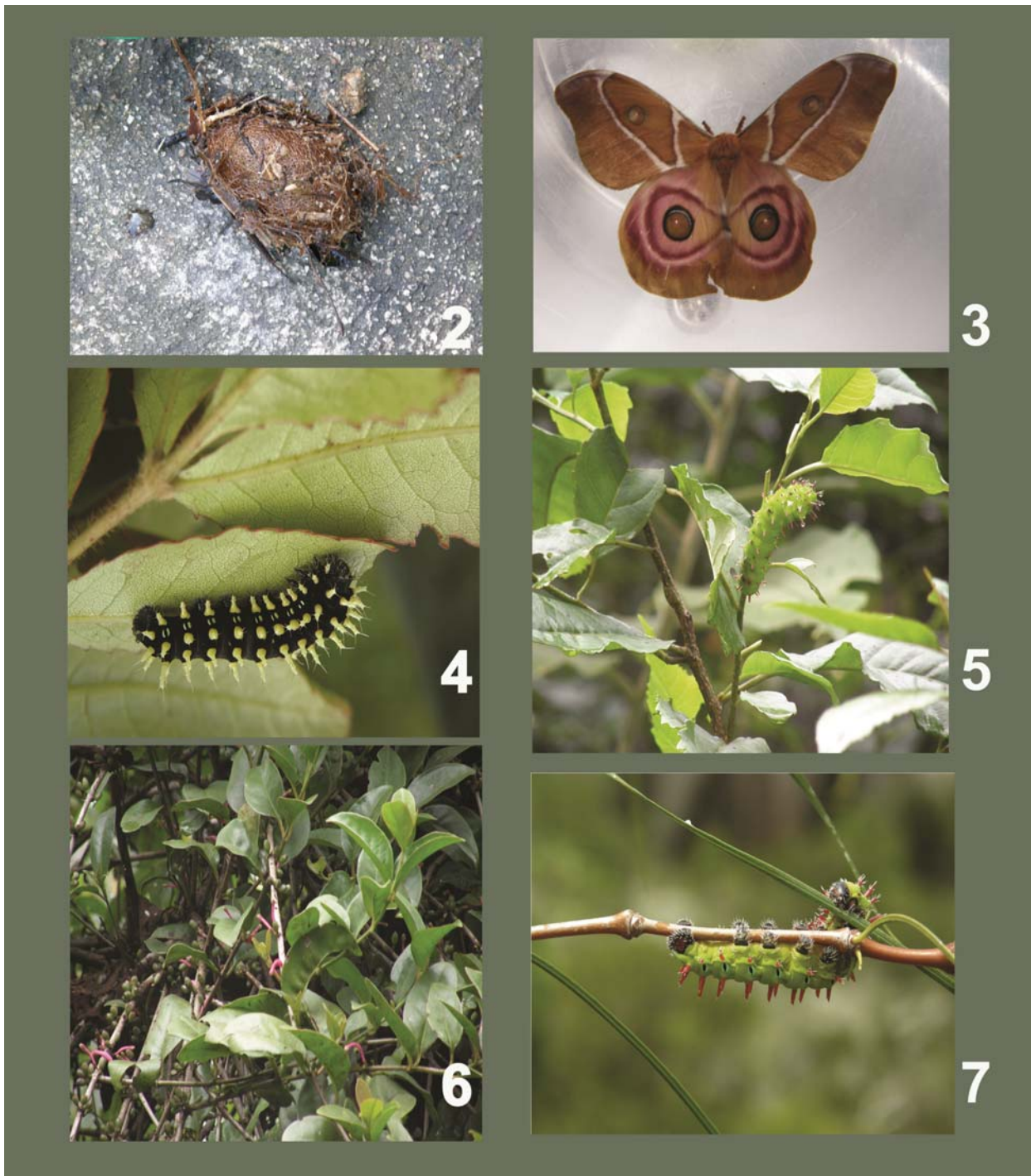
FIGS. 2–7. (2) Antherina suraka live cocoon collected among grasses under a host plant. (3) Antherina suraka female on alert. (4) Antherina suraka third-instar larva feeding on leaf of Weinmannia sp. (Cunoniaceae) in Vohimana Forest in Madagascar. (5) Antherina suraka final-instar larva on Maesa lanceolata (Primulaceae) in Ranomafana National Park. (6) Bakerella grisea (Loranthaceae) in Ranomafana National Park, on which larvae of Antherina suraka were found but did not survive. (7) Antherina suraka final-instar larva on Ischnolepis tuberosa (Apocynaceae) in Anjà Forest.