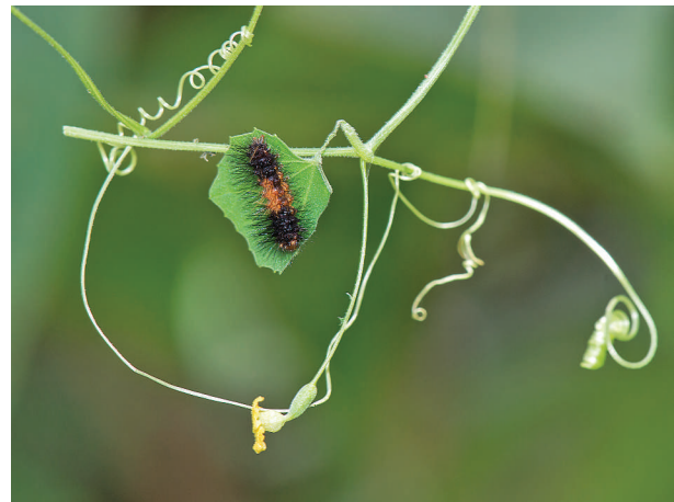
FIG. 1: Antepenultimate instar of Hypercompe cunigunda (Stoll, 1781) on Melothria pendula L. (Cucurbitaceae), Colakreek, Suriname, 3 March 2014. Note pistillate yellow flower below.

Antepenultimate instar (Fig. 1, Fig. 2a, b). Head : vertices and frons black, no spines or scoli; light gray line over coronal sulcus and upper one-fourth of adfrontal sulci; clypeus light gray, upper border convex; labrum dirty yellow with in upper half a semicircular