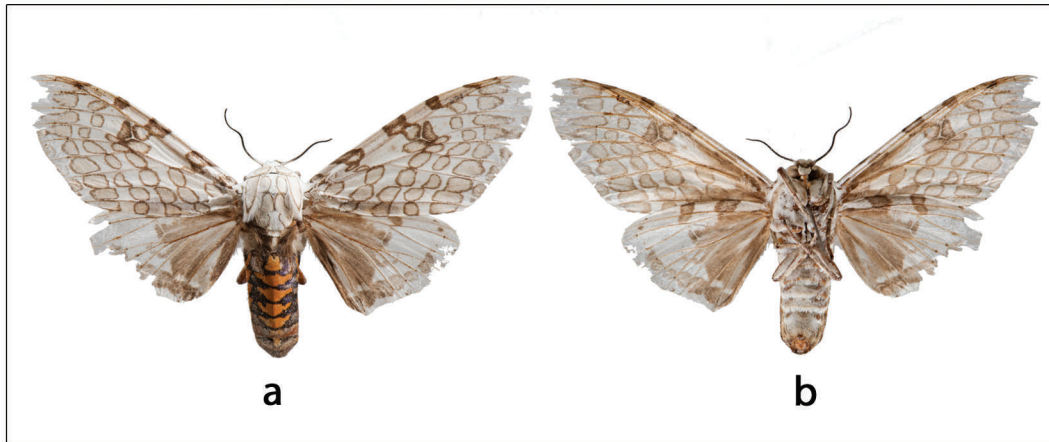
Fig. 3: Enclosed female of Hypercompe cunigunda (Stoll, 1781) from Suriname. a : dorsal view; b : ventral view.