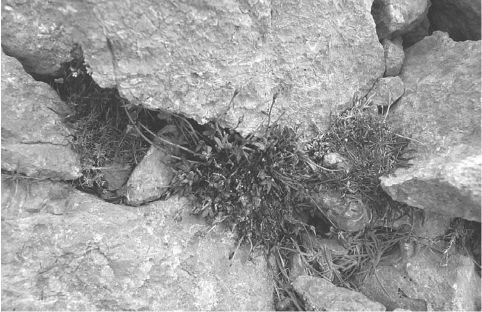
Fig. 3. Asyneuma junceum, with Alopecurus lanatus and Minuartia juniperina on the summit plateau of an unnamed lateral summit N of the Uyluk Tepe, Akdağ, Lycian Akdağları above Gömbe, c. 2900 m.