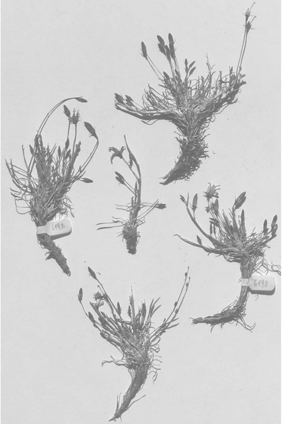
Fig. 2. Asyneuma junceum – Lycian Akdağları above Gömbe, Döring, Parolly 6198 & Tolimir (B).