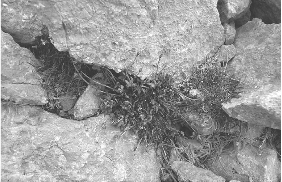
Fig. 3. Asyneuma junceum, with Alopecurus lanatus and Minuartia juniperina on the summit plateau of an unnamed lateral summit N of the Uyluk Tepe, Akdağ, Lycian Akdağları above Gömbe, c. 2900 m.