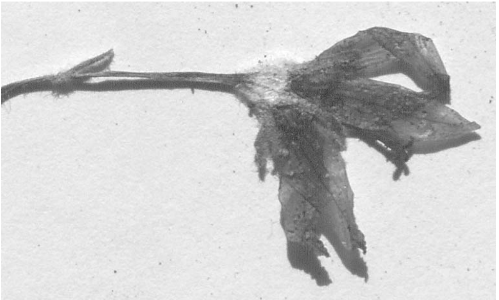
Fig. 5. Asyneuma compactum var. eriocarpum – flower in detail showing the dense lanate-tomentose indumentum of the ovary and calyx. – From the holotype at B.