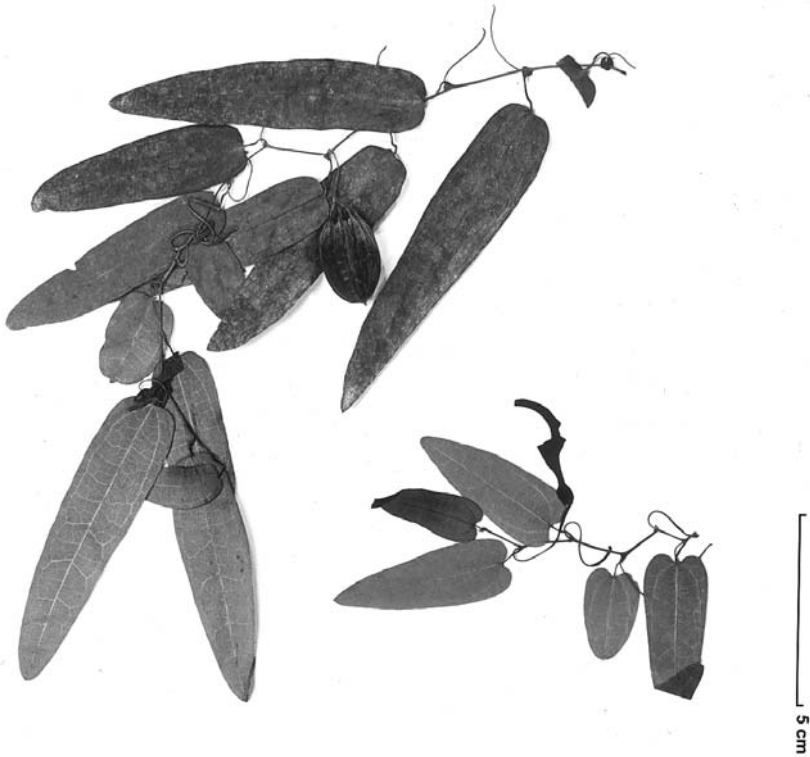
Fig. 4. Aristolochia stenophylla – one flowering and one fruiting branch from the epitype collection (Greuter & Rankin 24893).

nio del Sur, Abra de Mariana, loma al este del barranco, 6.2.1978, Bisse & al. 36553 (HAJB, JE); San Antonio del Sur, Abra de Mariana, loma al oeste del barranco, 6.2.1978, Bisse & al. 36594 (B, HAJB, JE, K).