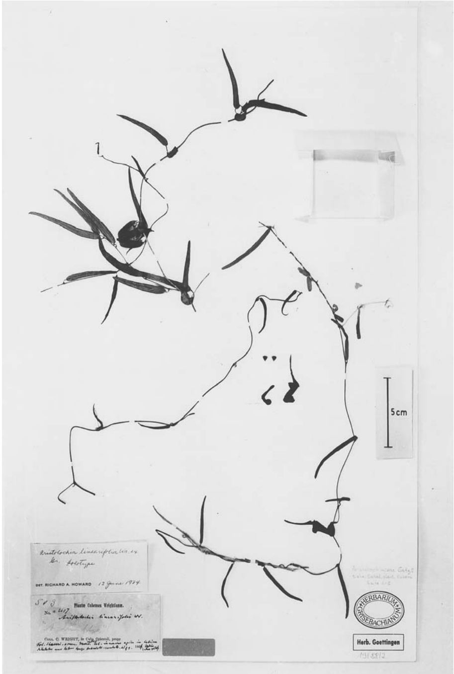
Fig. 1. Aristolochia linearifolia – the Wright sheet at Göttingen (GOET) that bears the lectotype specimen, which is the flowering plant in the lower right corner.