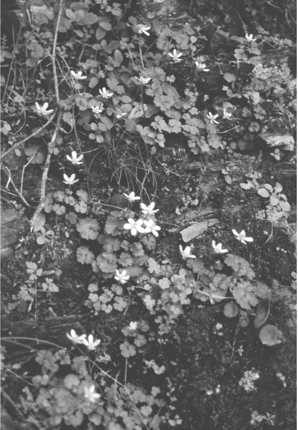
Fig. 3. Ranunculus veronicae – plants at the locus classicus near Kambos, Crete.