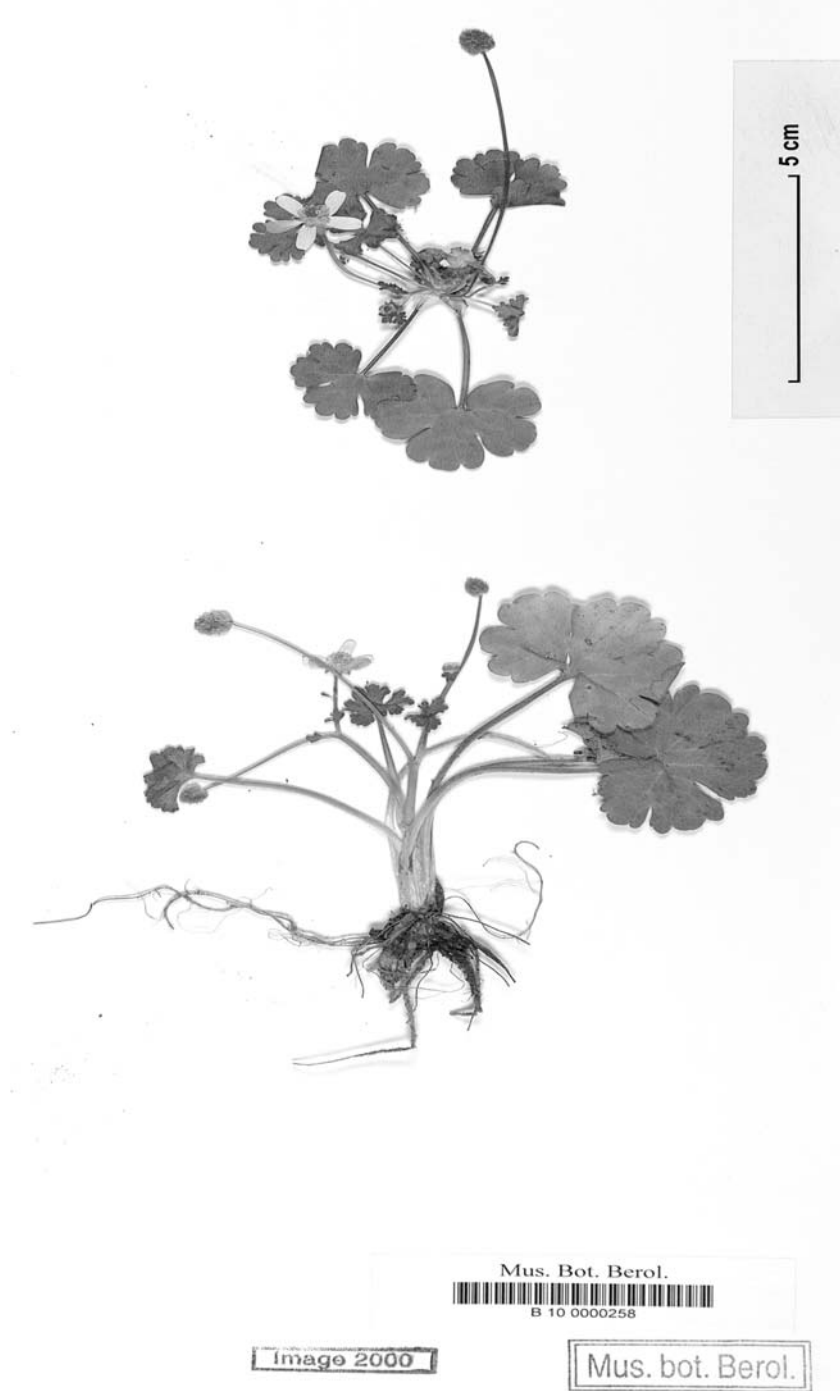
Fig. 2. Ranunculus veronicae – plants of the holotype sheet (Böhling 7066) at B.