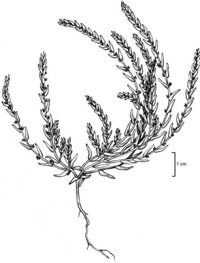
Fig. 1. Suaeda tschujensis Lomon. & Freitag; one of several individuals of the collection Korolyuk 82 (NS). – Drawing by N. Prijdak.