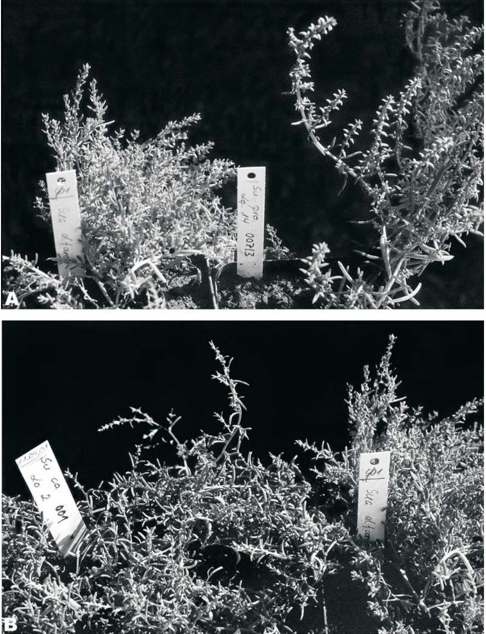
Fig. 3. Suaeda tschujensis Lomon. & Freitag cultivated side by side with related species – A: with S. prostrata (on the right); B: with a delicate prostrate form of S. corniculata (on the left). – Photos by H. Freitag.