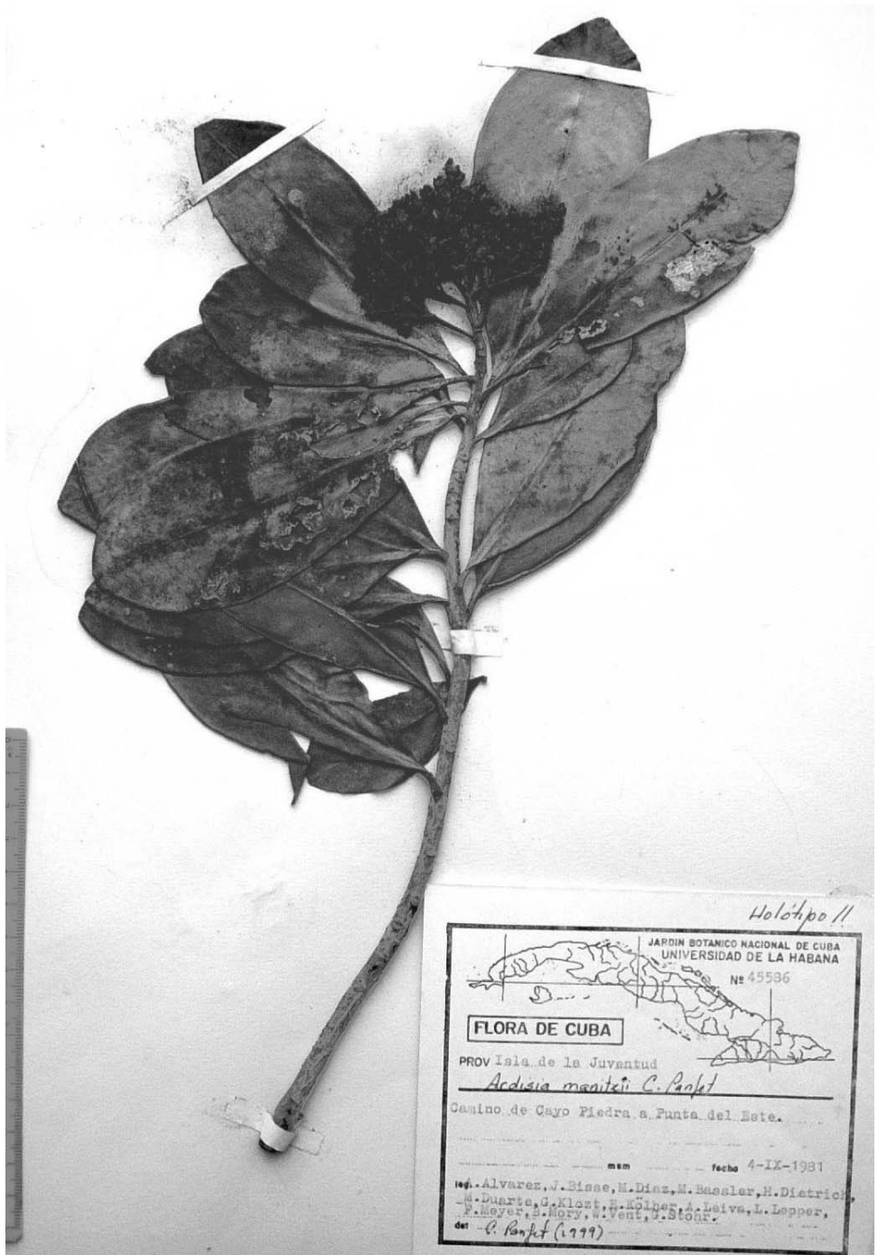
Fig. 1. Ardisia manitzii Panflet, holotype specimen.