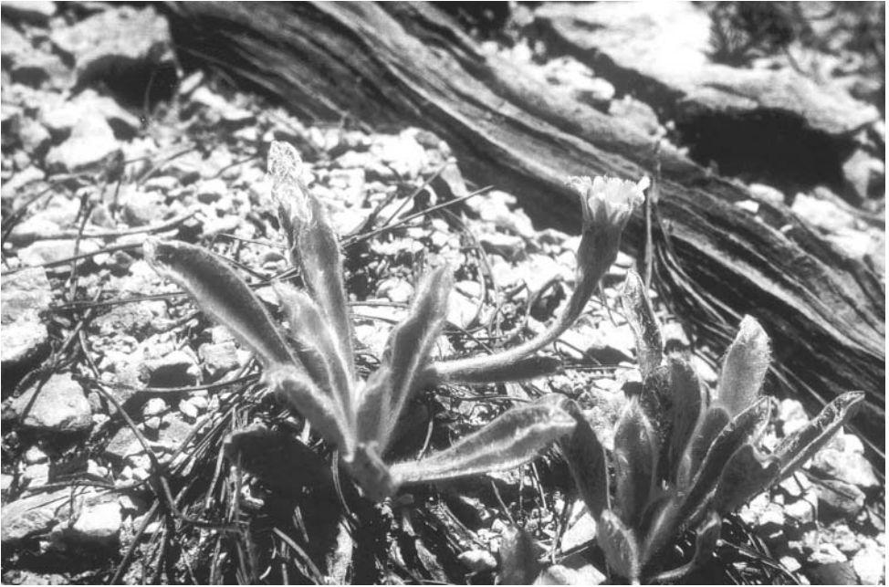
Fig. 1. Scorzonera karabelensis – photograph, from the type locality, by R. Ulrich, 2003.