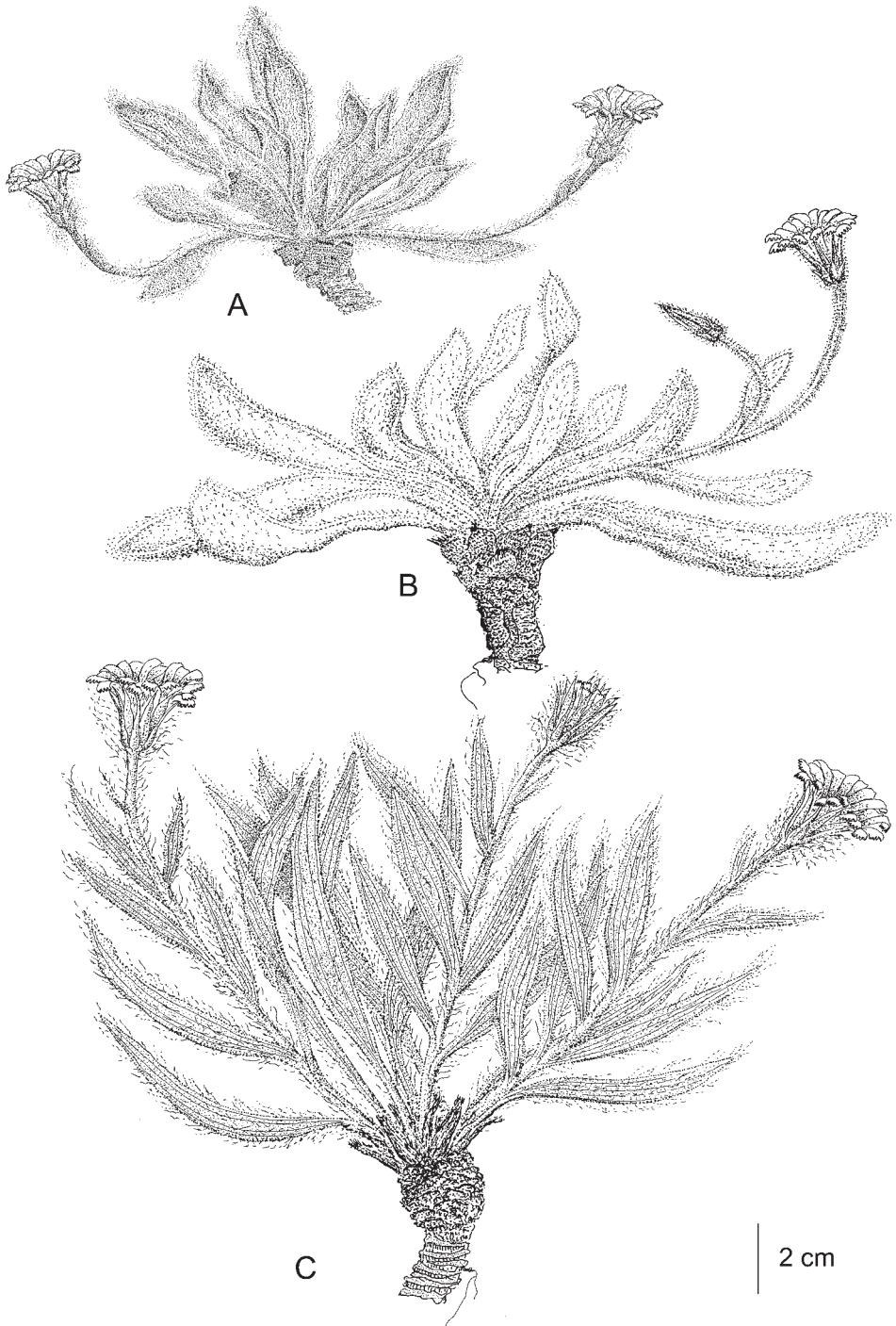
Fig. 2. Scorzonera karabelensis (A), S. ulrichii (B), S. pisidica (C) . – A after R. Ulrich 3/7b, B after R. Ulrich 2/12, C after R. Ulrich 2/22; drawings by Alexander Ehler (BGBM).