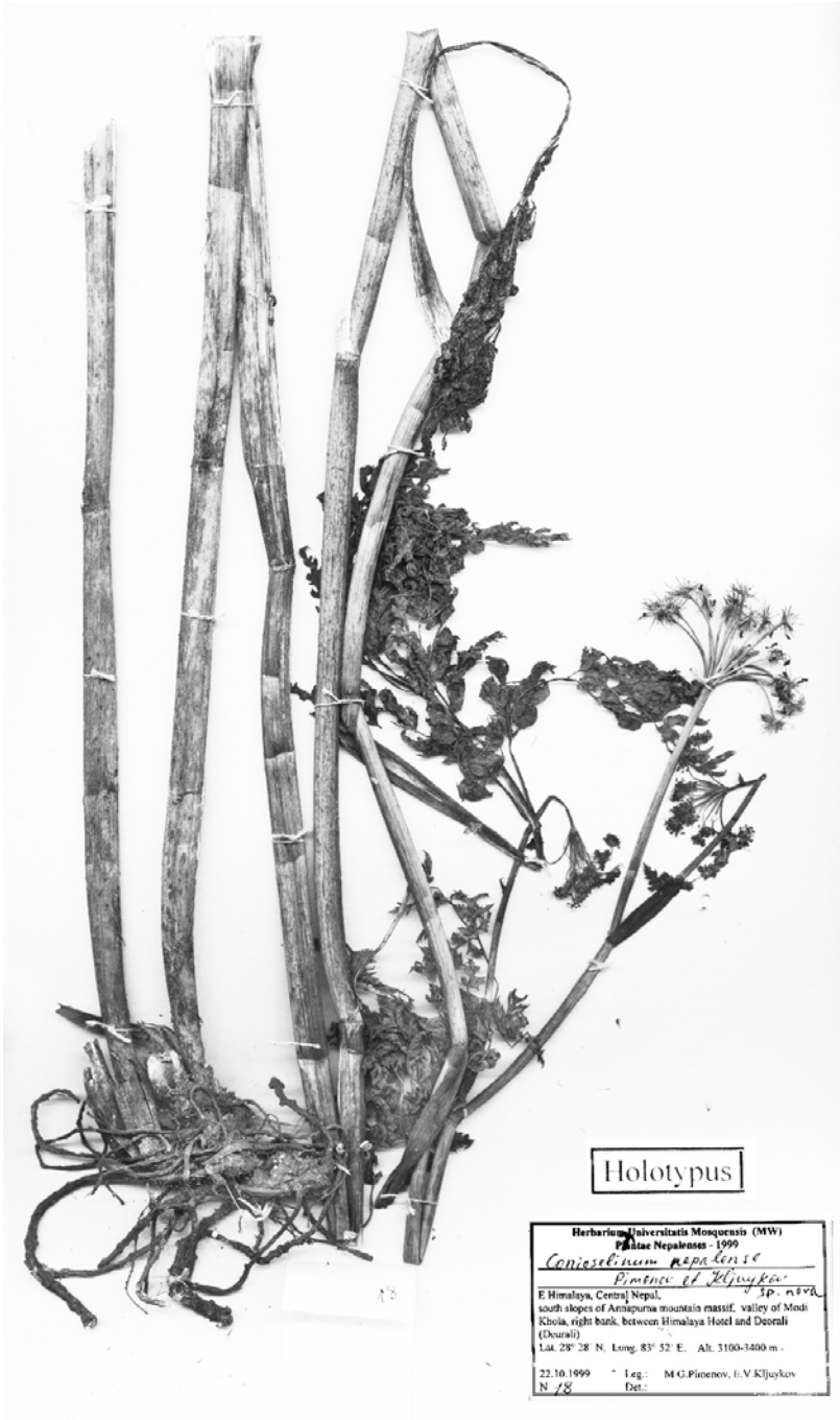
Fig. 10. Conioselinum nepalense – basal part of the holotype.