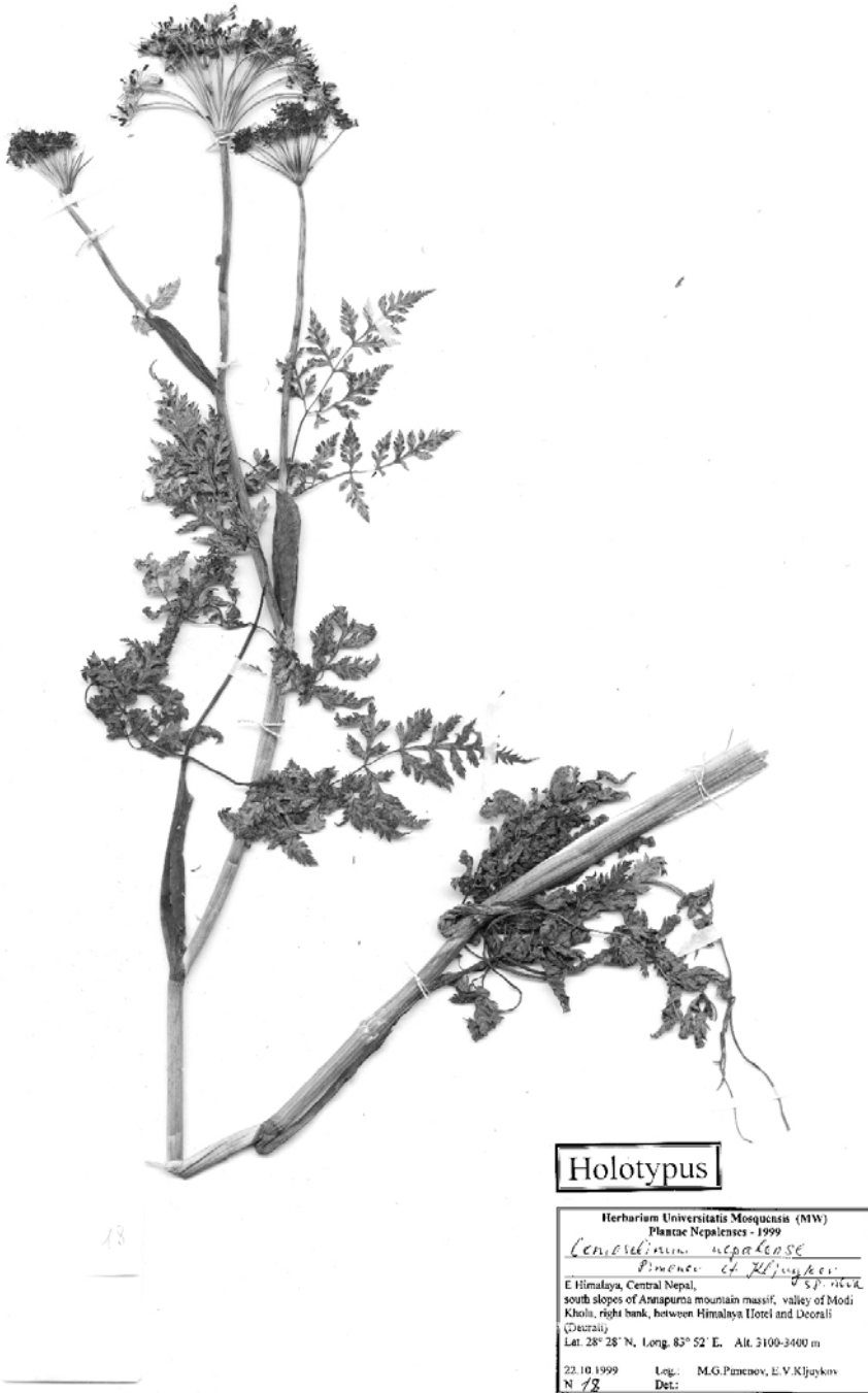
Fig. 11. Conioselinum nepalense – upper part of the holotype.